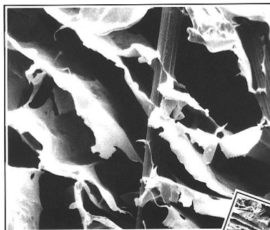
Vergößerung im Raster-Elektronenmikroskop Enlargement as seen through an electron microscope Agrandissement au microscope électronique