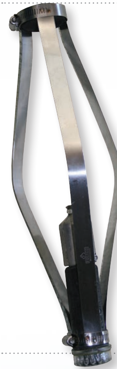
CENTRALIZER Model #centralizer