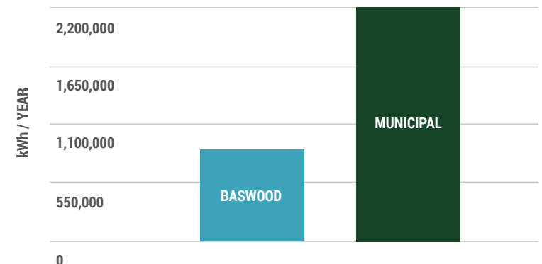
MUNICIPAL PLANT ENERGY COMPARISON – 150K GPD