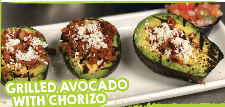
GRILLED AVOCADO WITH CHORIZO