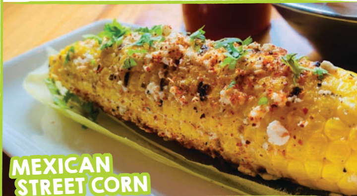
MEXICAN STREET CORN