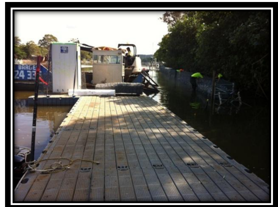
Work Platform and 'Porta Loo' in Nerang River for Gabion Baskets

Spuds (poles and brackets) can be supplied to hold it in place on the seafloor and a workboat can be supplied to push into position and to move workers and equipment back and forth. Perfect platform for bridge maintenance work.