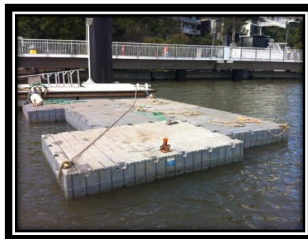
On hire for a major construction project in Brisbane.