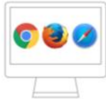
PC and Mac Chrome | Firefox | Safari