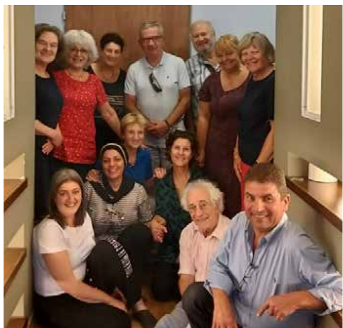
The Dutch delegation visits the Help Center in Kfar Kana