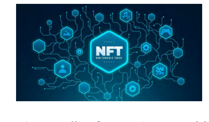
First Spells of Genesis NFT sold on OpenSea

The second collateralization of reactors