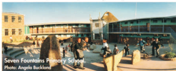
Seven Fountains Primary School.

The other recipients of Awards for Excellence were made to Stefan Antoni Olmesdahl Truen Architects for their office building, Hatfield 109, in Cape Town, and Typology Architects