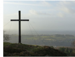
The cross on Cobden Edge, over 1000 feet above sea level, boasts fine views and was erected by Churches Together in Marple and District.