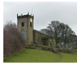
The church of St Thomas the Apostle has a rare Anglo-Saxon font within, and an eccentric gravestone mounted on the tower wall, some of which is written in a masonic cipher.