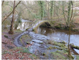
The so-called Roman Bridge is actually an 18th-century packhorse bridge over a rocky narrows on the River Goyt.