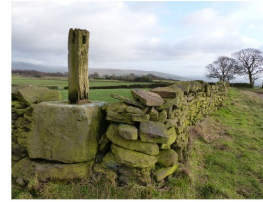
Hidden in a drystone wall at the junction of Primrose Lane and Black Lane is this medieval cross base, a Grade II listed building.