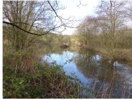
Roman Lakes began life as mill ponds for Mellor Mill (demolished after a fire in 1892), but are now a haven for wildlife and recreation.