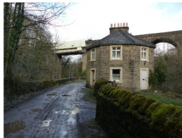
Floodgates Cottage (1801) was formerly the sluice-keeper's cottage for Mellor Mill, and possibly also a tollhouse. Behind is the Goyt Viaduct, built 1865.