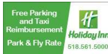
Sample banner on flyplattsburgh.com

flyplattsburgh.com is the number one lead generator for Allegiant Air, outperforming all other airport websites it serves.