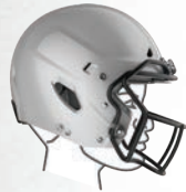
ALIGNMENT SET PROPERLY