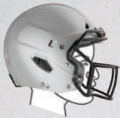
ALIGNMENT SET TOO HIGH