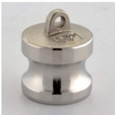
Dust Plug Male