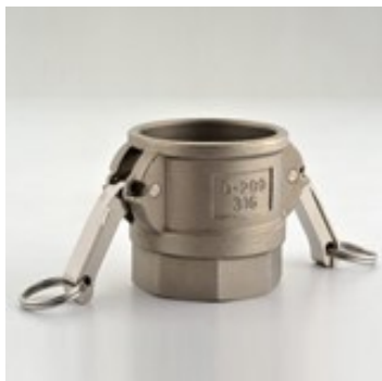
Coupler Female x BSP Female