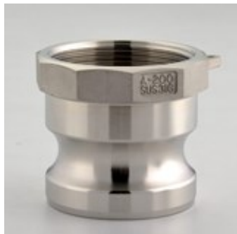
Adaptor Male x BSP Female