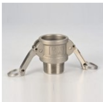
Coupler Female x BSP Male