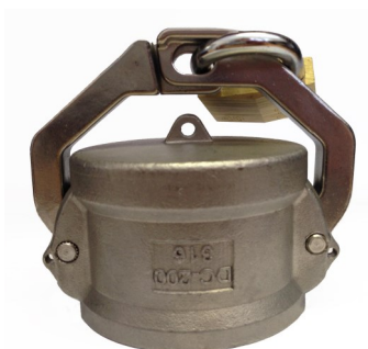
Dust Cap Locking