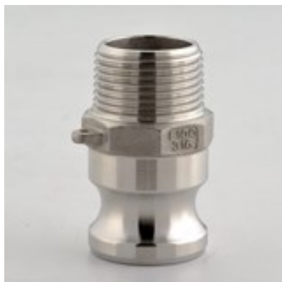
Adaptor Male x BSP Male