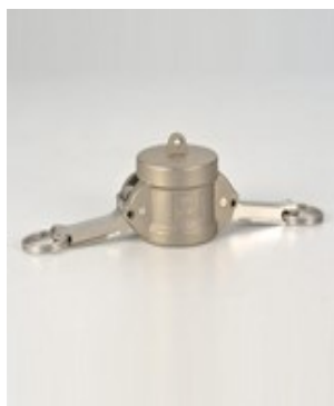
Dust Cap Female