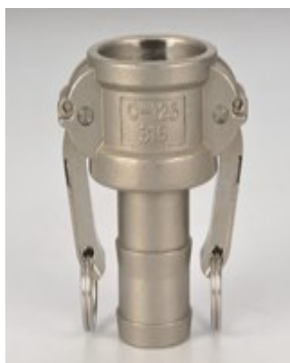
Coupler Female x Hosetail