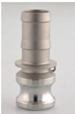
Adaptor Male x Hosetail