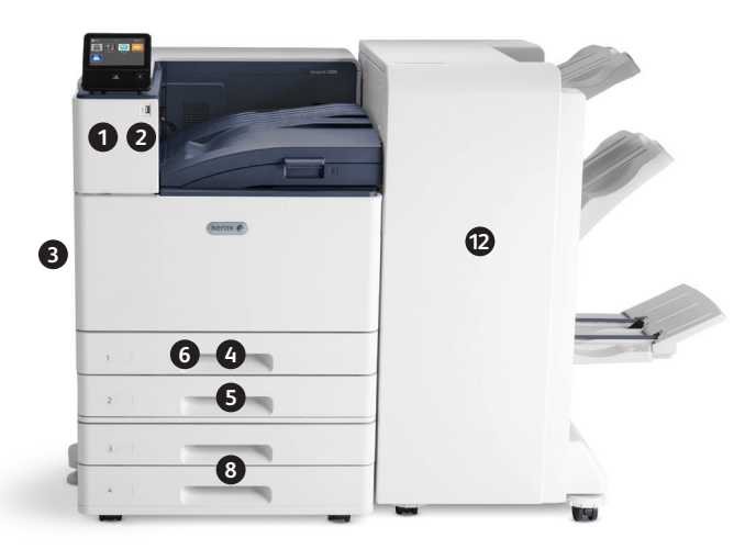
Xerox® VersaLink® C9000 Color Printer Print. Mobile connectivity.