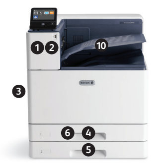
Xerox® VersaLink® C8000 and C9000 Default Configuration