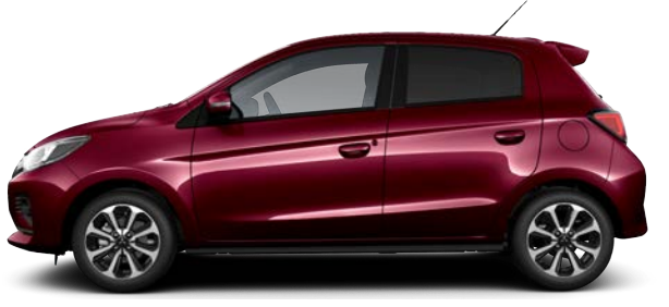
Purple Berry (P)