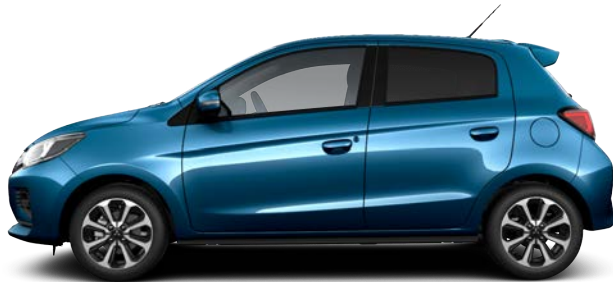
Reef Blue (M)