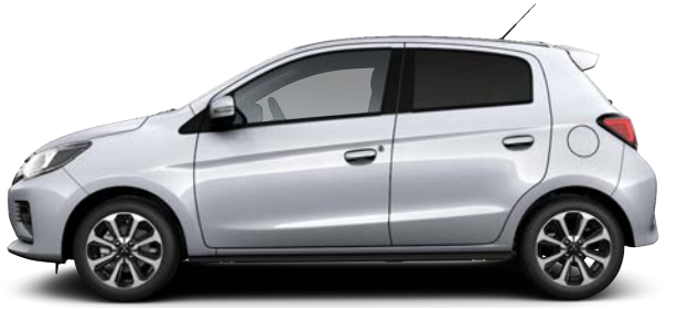
White Diamond (D)