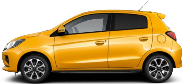
Sand Yellow (M)