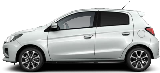
Polar White (S)