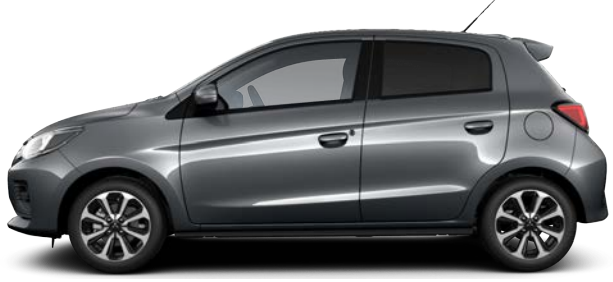
Atlantic Grey (M)