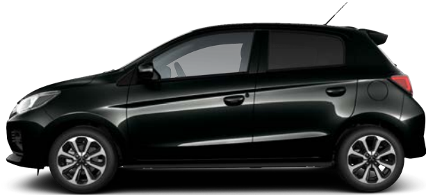
Cosmos Black (P)