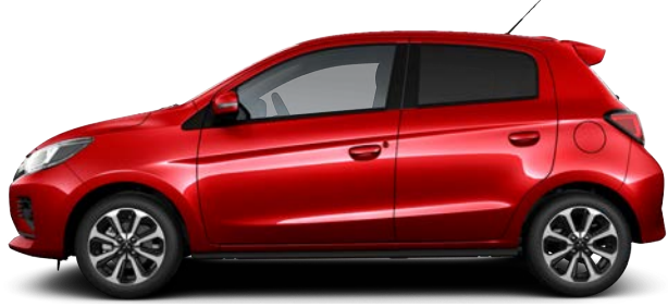
Red Metallic (M)