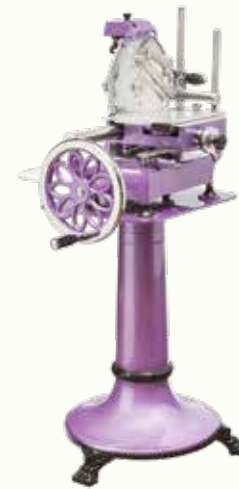
PURPLE FINISH WITH FLOWER FLYWHEEL