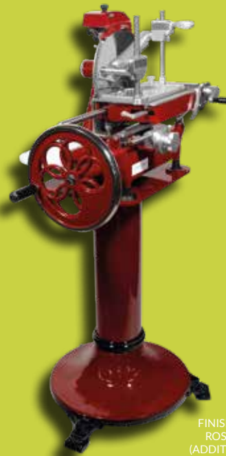
STANDARD RED FINISH WITH SPECIAL ROSETTE FLYWHEEL (ADDITIONAL CHARGE)