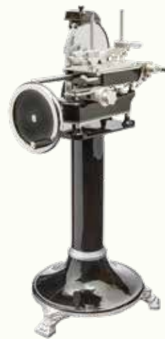
BLACK FINISH WITH SOLID FLYWHEEL