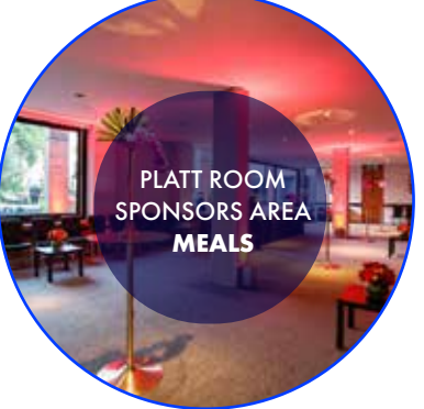
PLATT ROOM SPONSORS AREA MEALS