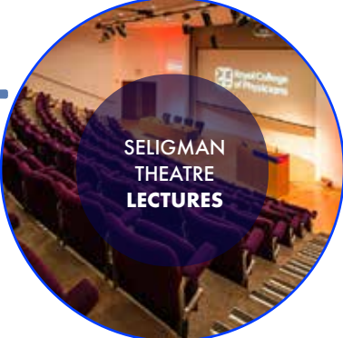
SELIGMAN THEATRE LECTURES