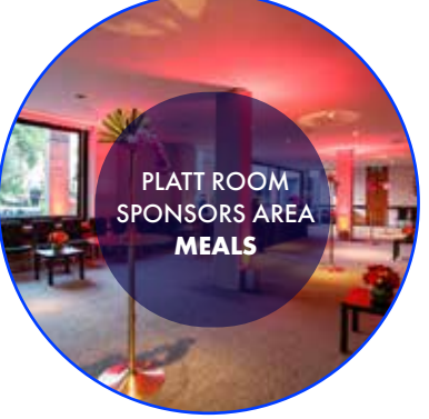
PLATT ROOM SPONSORS AREA MEALS