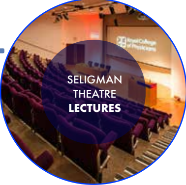
SELIGMAN THEATRE LECTURES