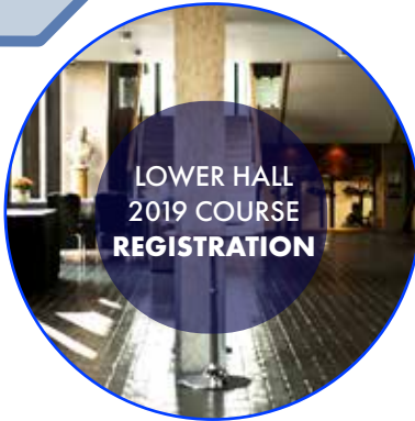
LOWER HALL 2019 COURSE REGISTRATION