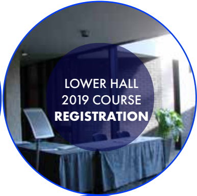
LOWER HALL 2019 COURSE REGISTRATION