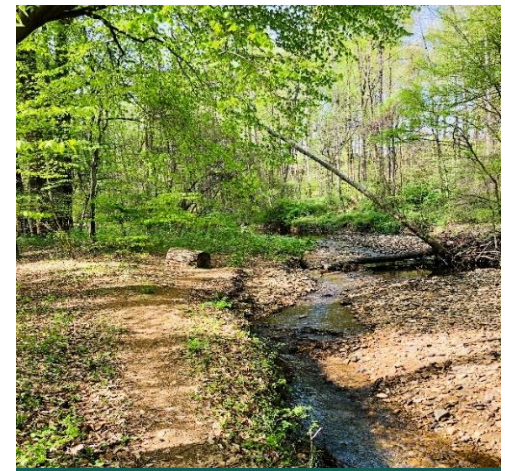
Adjoining Walking Trail