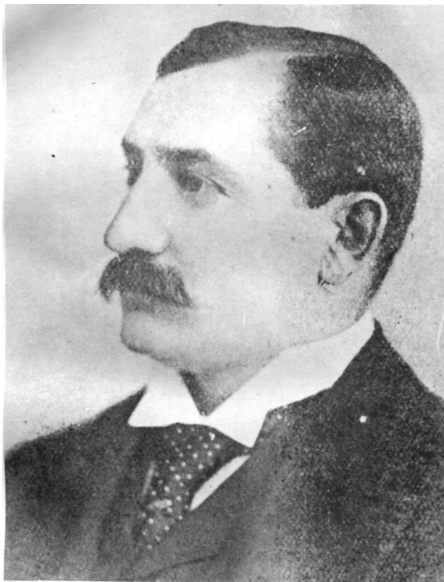
Judge Vincent (1902)