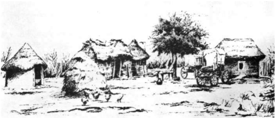
Rennie Tailyour's Camp at Bulawayo, 27 Oct. 1891.

Moreover, it was not within the power of the Government to alter the deed of grant of the East Clare Block by adding a clause embodying the