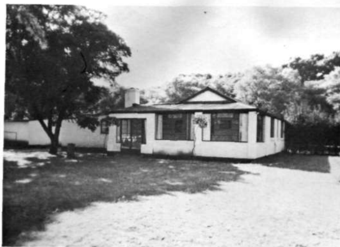
44, Heyman Road, Bulawayo.