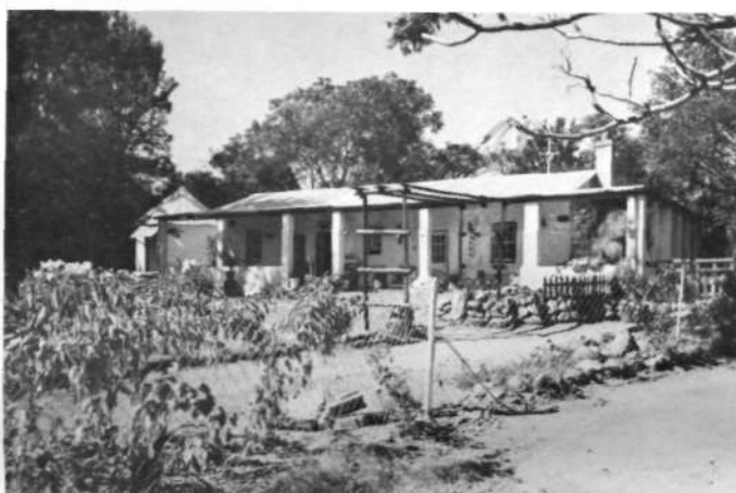
11, Kent Road. First Police Station at Hillside, Bulawayo.