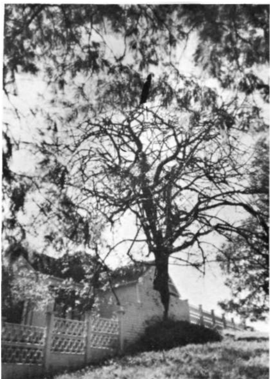
The Signal Tree, Duncan Rd/1st Street, Bulawayo.