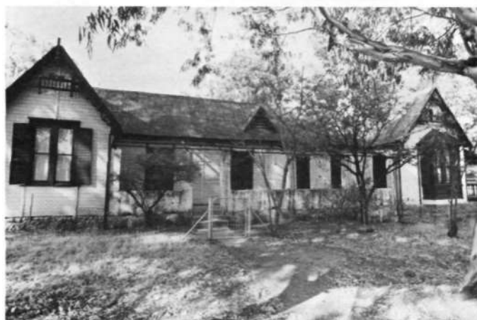
Fletcher Cottage