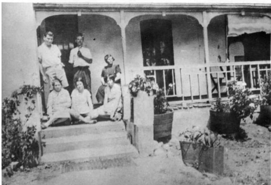
Front verandah of Barton Grange, 12 Oxford Road — Taken about 1932.