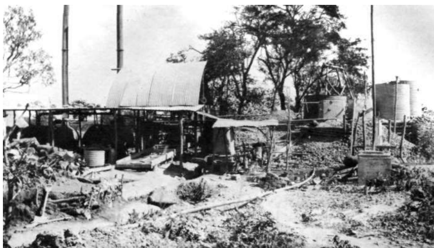
Piper Moss Mine, Que Que dsitric, 1914.