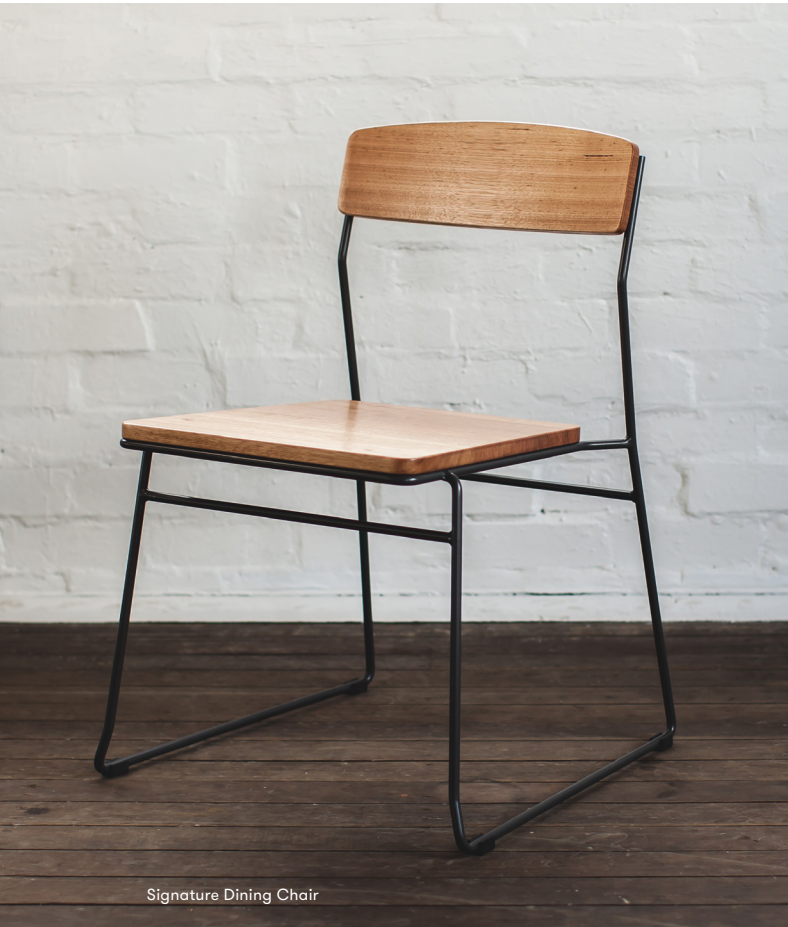
Signature Dining Chair