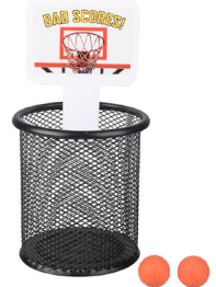
Dad B'ball Pencil Cup - $4.50 10% 20% 30% $5.00 $5.75 $6.50