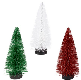
Mini Glitter Tree - $0.80