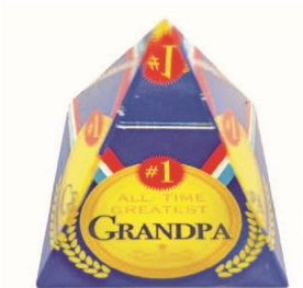
G'pa Glass Pyramid - $3.50