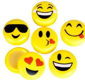
Emoticon Lip Gloss - $2.25