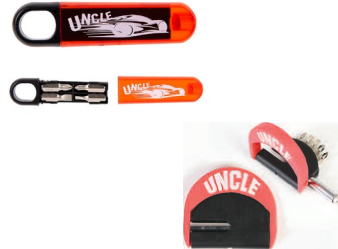
Asst'd. Uncle Tool Set - $2.00