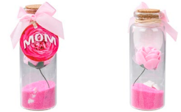
Mom Gift Jar - $1.55