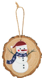
Snowman Ornament - $2.40