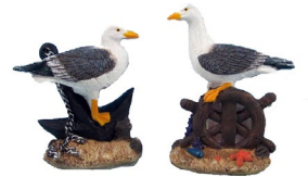
Sea Bird - $1.80