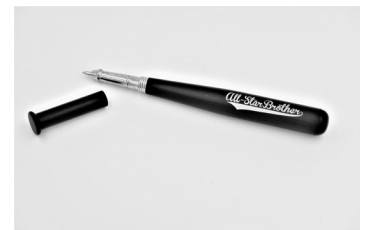
Brother Bat Pen - $1.55