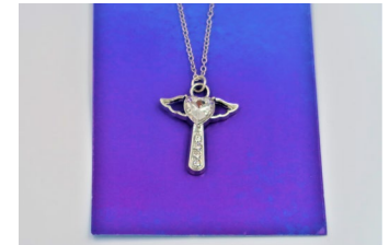
Angel Necklace - $2.80