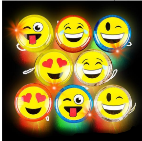
Emoji Yo-Yo - $1.55