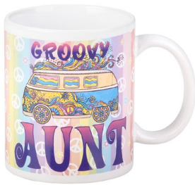
Aunt Mug - $3.50