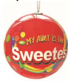
Aunt Ornament - $2.40