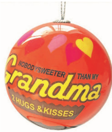
Grandma Ornament - $2.40