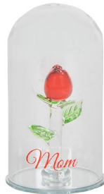
Mom Rose in Dome - $4.50 10% 20% 30% $5.00 $5.75 $6.50