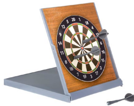
Magnetic Dart Board - $5.40 10% 20% 30% $6.00 $6.75 $7.75