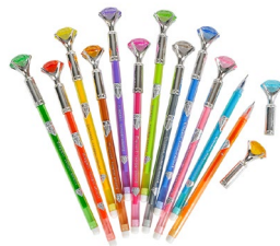
Diamond Gel Pen - $0.70