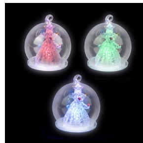
Tree Ball Ornament - $4.00 10% 20% 30% $4.50 $5.00 $5.75