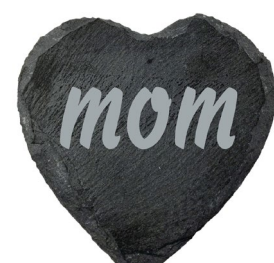
Mom Slate Coaster - $3.50