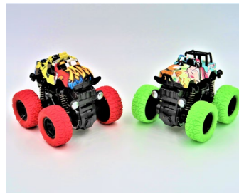
Big Wheel Truck - $4.50 10% 20% 30% $5.00 $5.75 $6.50