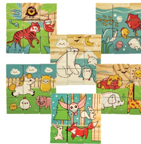
Wooden Block Set - $3.00