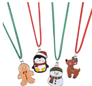
Christmas Necklace - $2.00