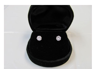
Asst'd. Earrings - $3.00