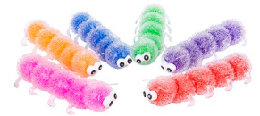
Squeezy Caterpillar - $3.00