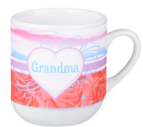
Grandma Mini Mug - $2.00