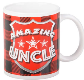
Uncle Mug - $3.50