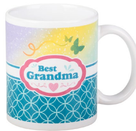
Grandma Mug - $3.50