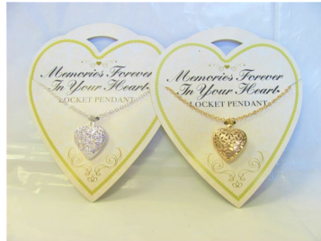
Heart Locket on Card - $3.00