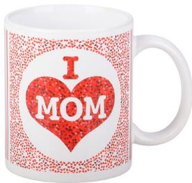
Mom Mug - $3.50