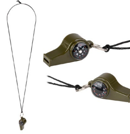
Survival Whistle - $1.80