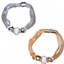
Asst'd. Bracelet - $2.60