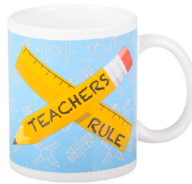
Teacher Mug - $3.50