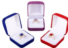
Cocktail Ring - $4.00 10% 20% 30% $4.50 $5.00 $5.75