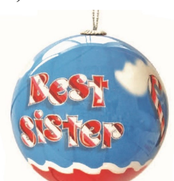
Sister Ornament - $2.40