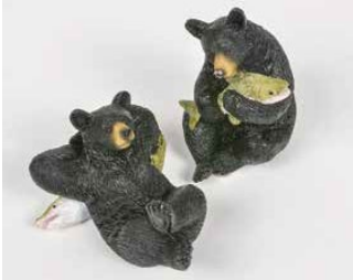
Playful Bear Figure - $2.00