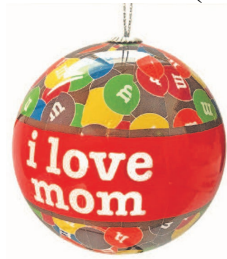
Mom Ornament - $2.40