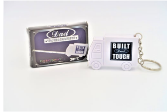
Dad Tape Measure - $2.00