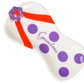
G'ma Jewelry Dish - $1.55