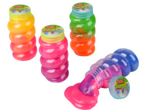
Twist Slime - $2.40