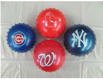
Ass't'd Knobby Balls - $3.00