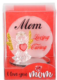
Mom Glass Angel - $5.40 10% 20% 30% $6.00 $6.75 $7.75