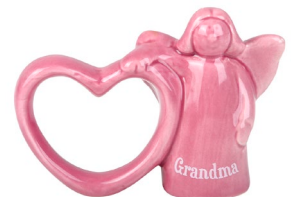
G'ma Angel w/ Heart - $2.80