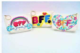
“BFF” Coin Purse - $2.25