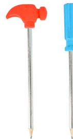
Tool Pencil - $0.70