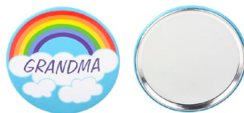
G'ma Button Mirror - $0.60