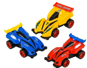
Friction Racer - $2.25