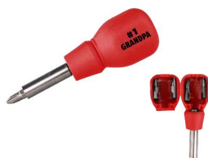
Grandpa Screwdriver - $2.40