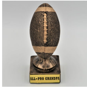
G'pa Football Trophy - $5.40 10% 20% 30% $6.00 $6.75 $7.75