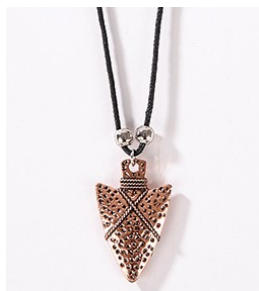
Arrowhead Necklace - $2.00