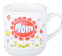
Mom Mini Mug - $2.00