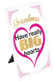
Grandma Plaque - $3.50