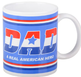
Dad Mug - $3.50