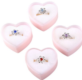
Tiffany Ring - $1.60