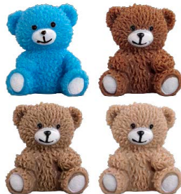
Squeeze Teddy Bear - $1.80