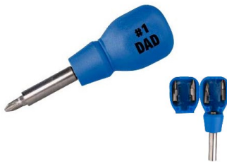
Dad Screwdriver - $2.40