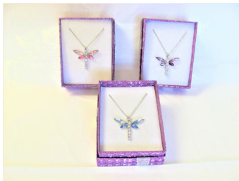
Dragonfly Necklace - $4.50 10% 20% 30% $5.00 $5.75 $6.50