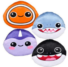
Aquatic Plush - $2.00