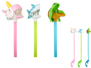
Asst'd. Grabber - $1.80