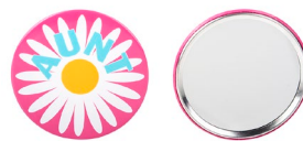
Aunt Button Mirror - $0.60