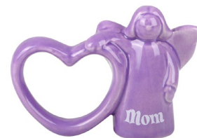
Mom Angel w/ Heart - $2.80