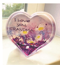
G'ma Water Photo - $5.40 10% 20% 30% $6.00 $6.75 $7.75