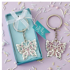
Butterfly Keychain - $2.60