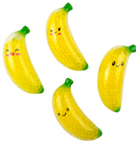
Bead Banana - $1.80