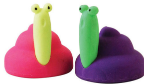
Snail Eraser - $1.35