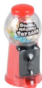
Gumball Bank - $3.50 10% 20% 30% $4.00 $4.50 $5.00