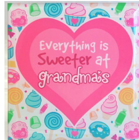
Grandma Plaque - $1.80