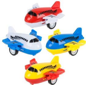
Airplane - $0.70