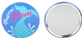
Mom Button Mirror - $0.60