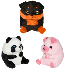
Belly Buddy Plush - $3.50