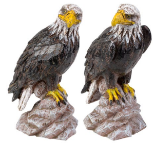
Eagle Figure - $3.50