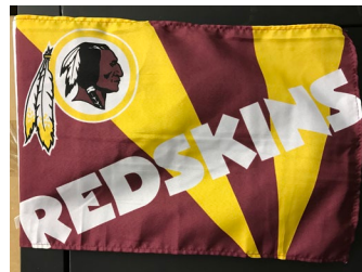
NFL Flag - $2.80