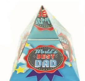
Dad Glass Pyramid - $3.50