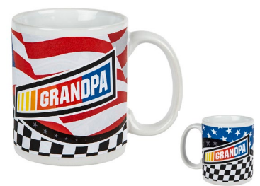
Grandpa Mug - $3.50