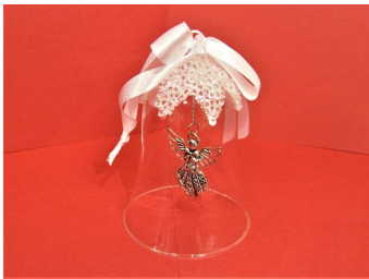
Angel Bell - $5.40 10% 20% 30% $6.00 $6.75 $7.75