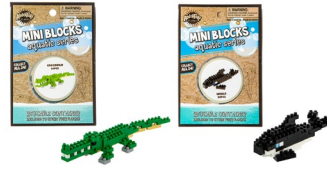
Mini Block Set - $3.00