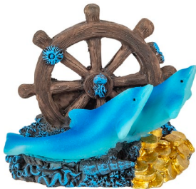
Dolphin Figure - $2.80