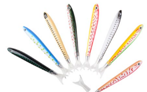
Fishing Lure Pen - $2.60