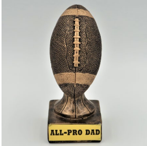
Dad Football Trophy - $5.40 10% 20% 30% $6.00 $6.75 $7.75