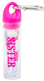
Sister Earbuds - $3.50