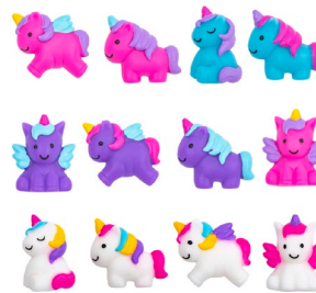
Gummy Unicorn - $0.80