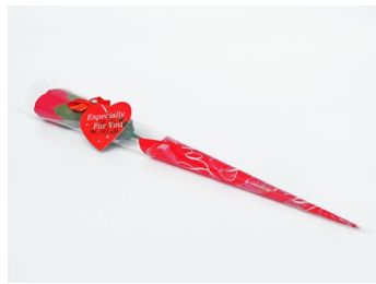
Long Stem Rose Soap - $1.55