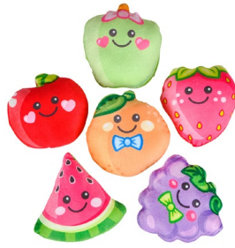
Fruit Plush - $1.80