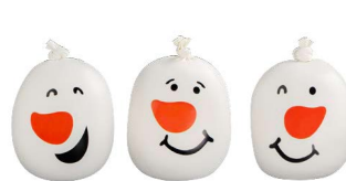
Snowman Stuffed Ball - $2.40