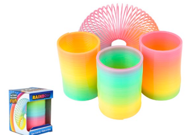
Rainbow Spring - $0.60