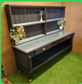
2.1m Potting Bench painted Black Ash