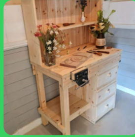
1m Wooden Workbench with Vice and Drawers