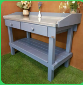
1.4m Potting Bench painted Inky Stone