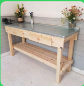
1.4m Wooden Workbench with Vice and Drawers