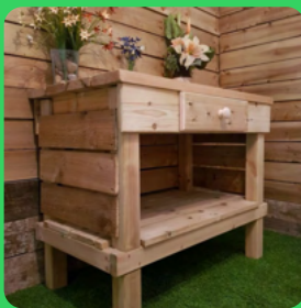
Potting Bench with Drawer