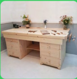
1.8m Wooden Workbench with Vices and Drawers