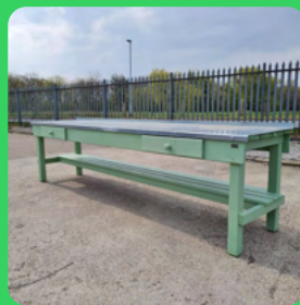
3m Potting Bench painted Highland Marsh