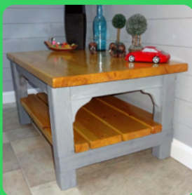
Farmhouse Coffee Tables