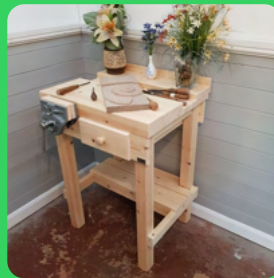
0.7m Wooden Workbench with Vice and Drawer