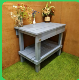
1m Potting Bench painted Forget Me Not