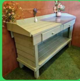
1.8m Potting Bench painted Highland Marsh