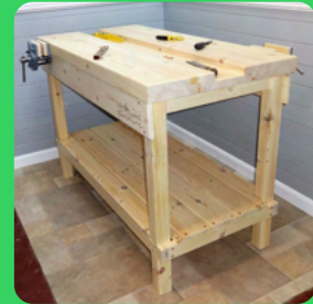
1.4m Wooden Workbench with Vice