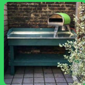
Steel Top Potting Bench