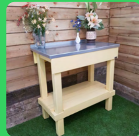
Potting Bench painted Buttercup Blast