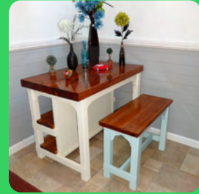
Kitchen Islands & Breakfast Bars