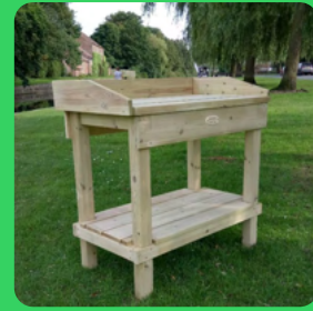
Unpainted Potting Bench