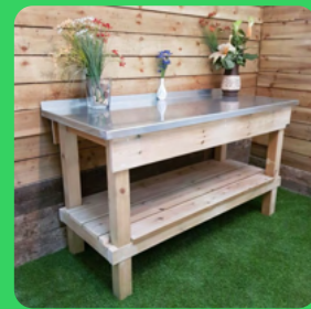
1.4m Potting Bench