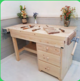
1.4m Wooden Workbench with Vices and Drawers