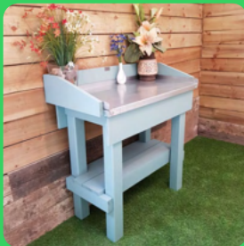
0.7m Potting Bench painted Seagrass and 0.45m deep