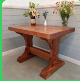
Refectory Style Dining Tables