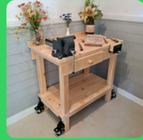
1m Wooden Workbench