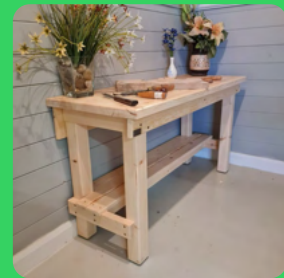
1.4m Wooden Workbench