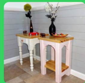
Side, Bedside & End Tables