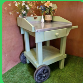
0.7m Potting Bench painted Highland Marsh