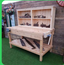
1.8m Wooden Workbench with Vices