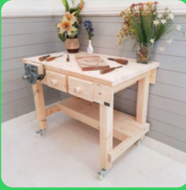
1m Wooden Workbench with Vice and Drawers