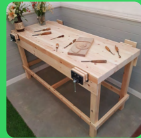
1.8m Wooden Workbench with Vices