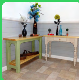
Farmhouse Console Tables