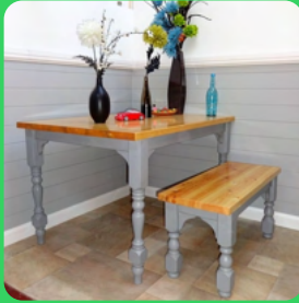
Farmhouse Dining Tables