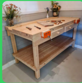
1.8m Wooden Workbench with Vices and Drawers