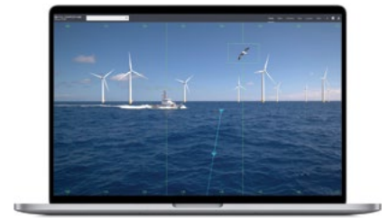
ML-enabled 24/7/365 Maritime Monitoring (Illustrative image only)

The location of detected targets is fused with other data sources—AIS and acoustics—to deliver a fully informed picture of the surrounding marine areas providing advanced security 24/7/365 days a year.