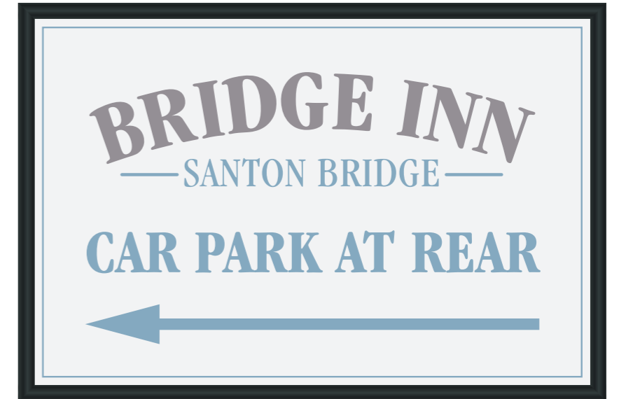
Car park signage (size TBC) - 2off