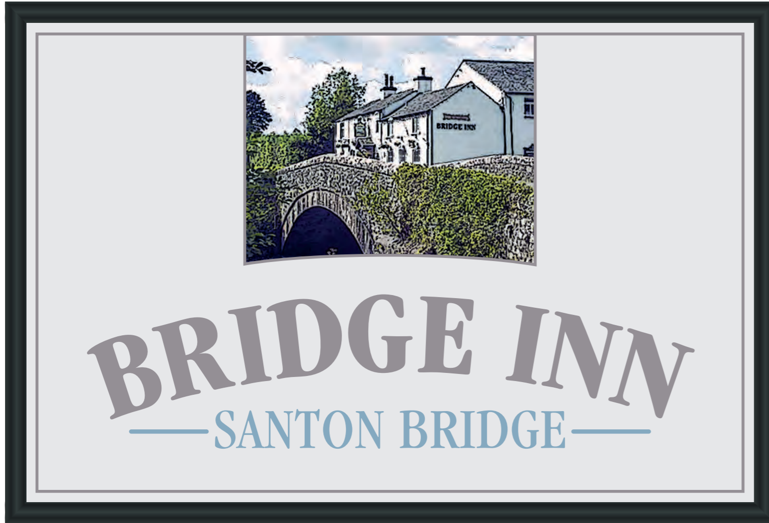
OPTION A: Gable board with raised lettering(size TBC) - 2 off