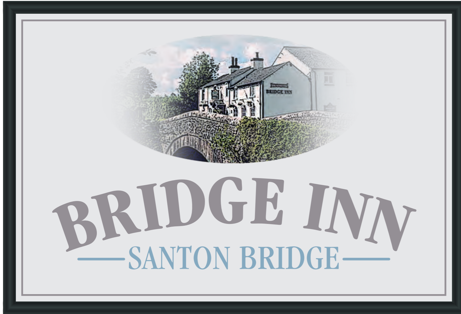
OPTION A: Gable board with raised lettering(size TBC) - 2 off