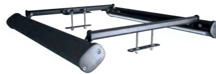
Pictorial trough lighting above pictorial