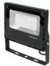
Flood light 50w warm - 8 off