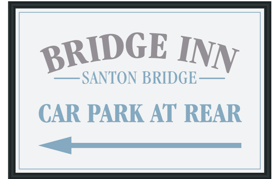
Car park signage (size TBC) - 2off