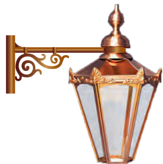
Copper finish latern (above amenity board)