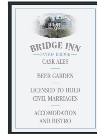
Amenity board (size TBC)