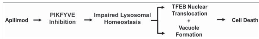
Figure 1. Model for apilimod mechanism of action in B-NHL.

To further explore the genetic factors underlying sensitivity of B-NHL cells to apilimod, we performed a genome-wide loss-of-function CRISPR screen to identify genes whose loss confers drug resistance to an otherwise sensitive B-NHL cell line. Remarkably, we identified the lysosome-related genes CLCN7 , OSTM1 , SNX10 and TFEB as the top factors inducing resistance. CLCN7 - OSTM1 form a chloride transporter required for proper lysosomal acidification, and CLCN7 is a TFEB target gene. SNX10 encodes an endosomal sorting nexin of largely unknown function, but the overexpression of SNX10 induces the formation of giant vacuoles. Finally, the discovery that loss of TFEB confers resistance in the screen underscores the importance of this lysosomal master regulator in determining apilimod sensitivity.