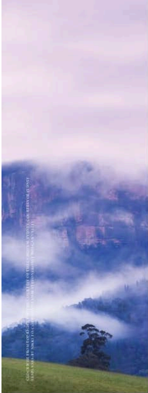
CLOCKWISE FROM TOP LEFT: THE COUNTRY OF THE GREAT DIVIDE, SYDNEY'S COASTLINE; KEAT RESTAURANT; SYDNEY SEAPLANES; QUAY RESTAURANT; A PRIVATE VILLA AT EMIRATES ONE&ONLY RESORTS; WOLGAN VALLEY