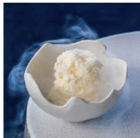
Clockwise from top right: The dining room at The Langham, Sydney's Kitchens on Keat restaurant; Sydney Seaplanes takes off for a daytrip to a restaurant along the coast; Quay restaurant's signature frozen dessert, Coral; the living room (with adjacent indoor pool and screened-in porch) in a private villa at Emirates One&Only resort in Wolgan Valley, west of Sydney.

back in time, sipping Australian sparkling wine amid the cream-hued, rattan-filled restaurant with a Gatsby -era vibe. The following afternoon, we hike near Bondi Beach and lunch at Icebergs Dining Room and Bar ( idrb.com ) with glorious ocean views. Our snapper with lemon, sorrel and olive oil, and a side of peas with biodynamic farro, celery, mint and salted ricotta, are light and refreshing. After a relaxing massage at The Langham, Sydney's spa, we head to the famed Quay restaurant ( quay.com.au ) for a six-course adventure in executive chef Peter Gilmore's Australian cuisine ($165 per person, wine pairings from $93 per person). Dishes include osetra caviar with smoked eel, walnuts and sea cucumber crackling; and smoked pig jowl with black-lipped abalone, shiitake mushroom and fan shell clams. Coral, a signature dessert, features white mango ice cream, coconut cream and white chocolate mousse that's topped with yet more white chocolate mousse frozen with nitrous oxide into a crispy coral-like mass.