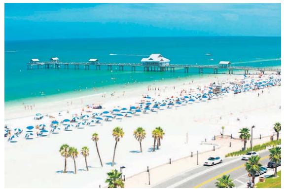
Want to catch a spring training game? Guests of the Wyndham Grand Clearwater Beach get tickets to see the Phillies play. NICHOLAS A. COLLURA-GEHRT

People travelling before April 30, 2020, can save 15 per cent to 30 per cent at more than 1,000 IHG Hotels & Resorts in the United States, Canada, Mexico and Brazil as long as you book by Feb. 29, 2020. Accor Hotels, which owns brands Fairmont, Swissotel, Sofitel, Novotel and more, is offering up to 25 per cent off stays in North and Central America. The longer you stay, the more you save, but you must book by March 30, 2020, for stays until April 30, 2020.