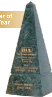
2004 & 2015 Award Winners