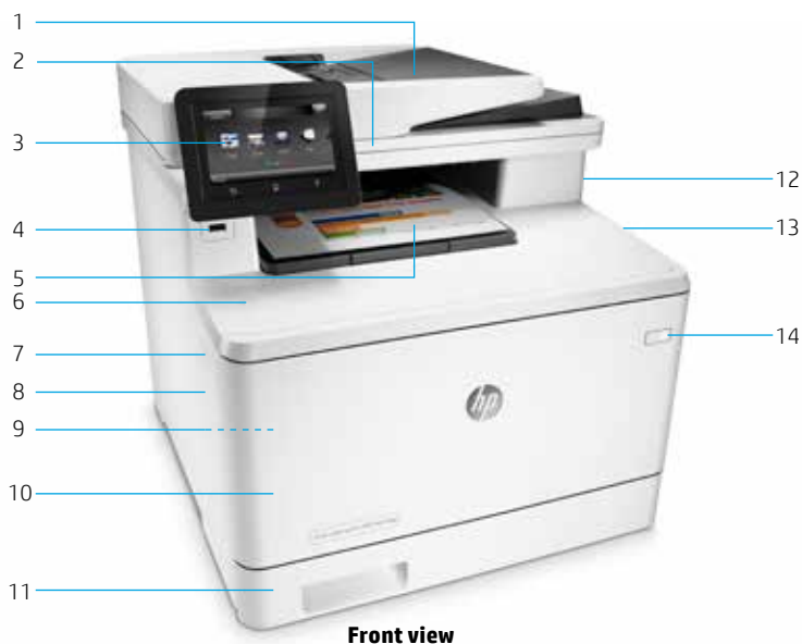
HP Color LaserJet Pro MFP M477fdw shown