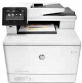
HP Color LaserJet Pro MFP M477fdw