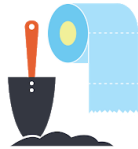
I will not leave any signs of human waste.