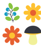
I will not pick endangered flowers.