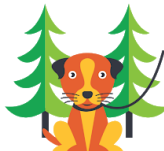
I will keep my dog under proper control.