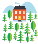
I will stay clear of private dwellings.