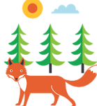
I will be conscious about humans and wild animals when enjoying the nature of Sweden.