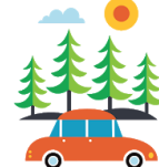
I will only operate a motor vehicle where permitted.