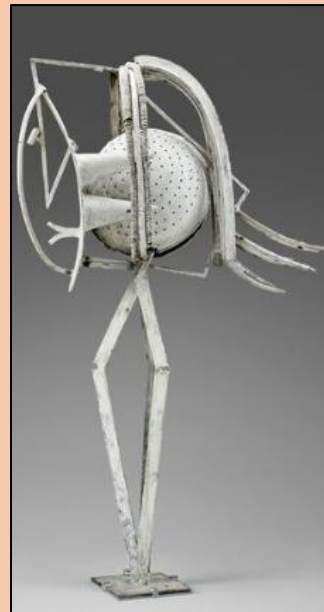
Head of a Woman (1929-1930)