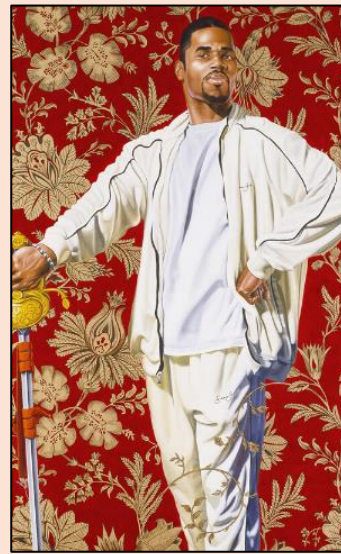
Willem van Heythuysen (2005)