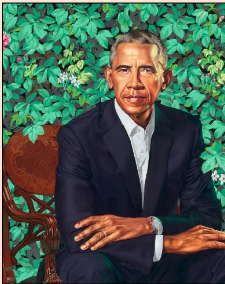
Barack Obama (2018)