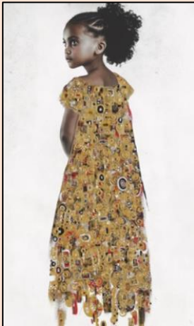
God's Gift (2019)