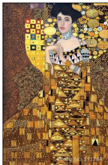
Portrait of Adele Bloch Bauer I (1907)