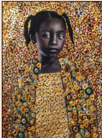
The Revelation/Glory (2019)