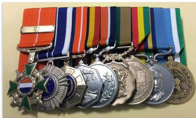
Medal rack of late Major Arthur Walker, HCG & Bar, SM

However, medal applications can still take a significant amount of time to be processed and results cannot always be guaranteed within a defined period of time.