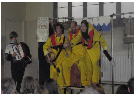
Mikron cast dressed for the weather!!!

In recent years a performance by Mikron travelling theatre company has become a regular fixture in SAGE's calendar and up to now we've been lucky with the weather. This year our luck changed and the heavens opened! But nevertheless the show went on – simply transferred to St James church a fantastic local community space. The play's theme of RNLI felt quite appropriate with the cast regularly donning heavy duty waterproofs as rain thundered on the roof outside! But our audience of over 120 were nice and cosy – fortified by teas, cakes and hot dogs. Not only did all enjoy a fantastic evening but we made over £400 matched by a Lloyds Bank Foundation volunteer to bring in a whopping £800. We're very glad we didn't cancel!