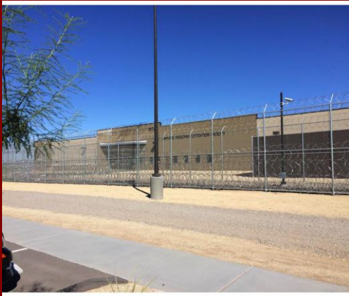
Imperial Regional Detention Facility (IRDF) Calexico, CA