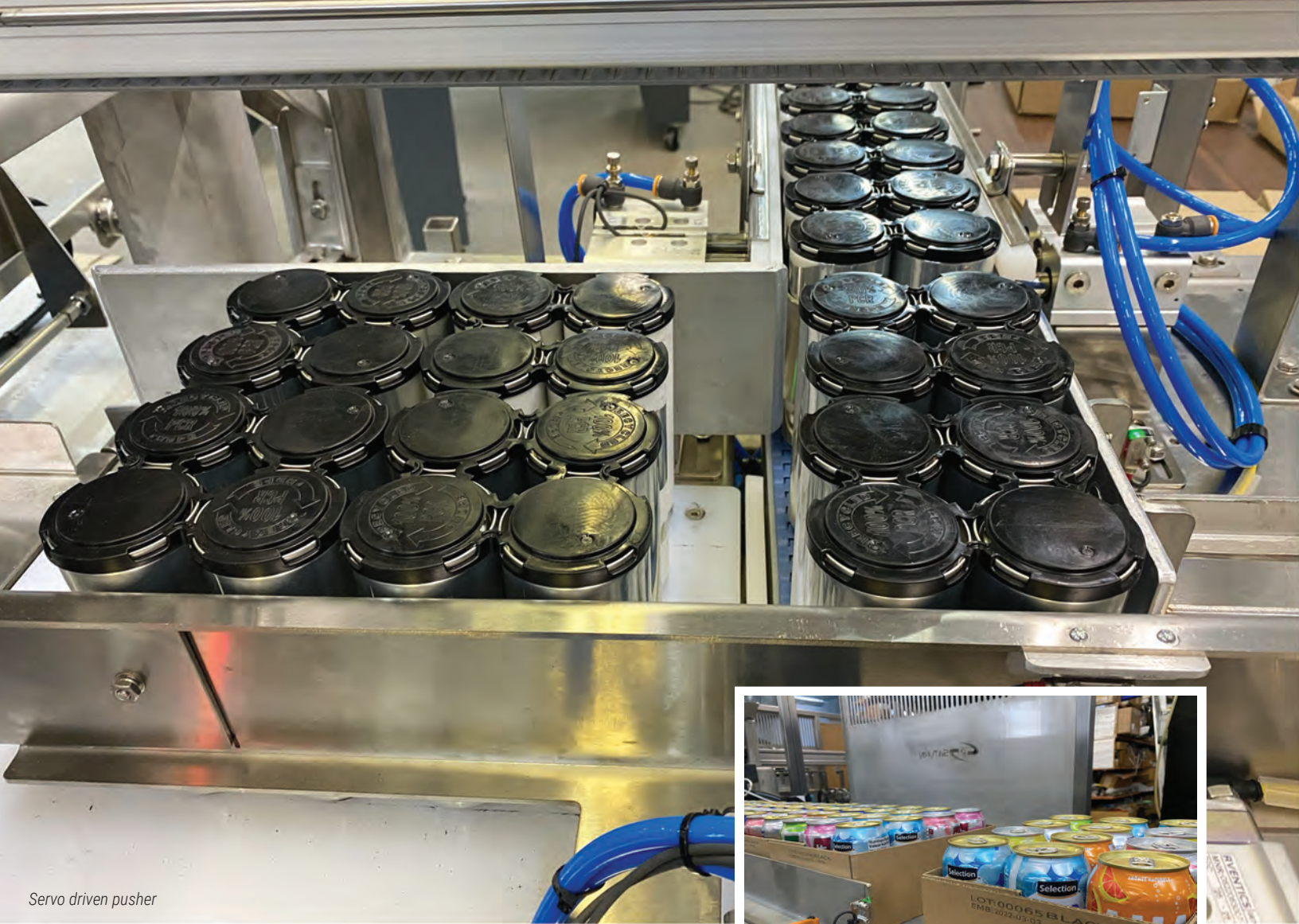
Servo driven pusher