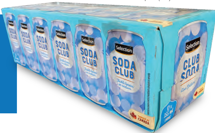
12-pack (6x2) cartoner - 355ml