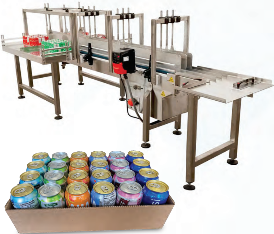
24 pack tray with multipack infeed system (level 1)