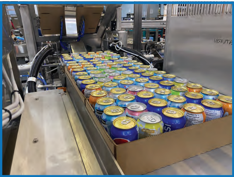
Automatic tray packer T-CART5