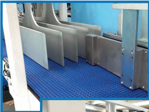
Automatic lane divider