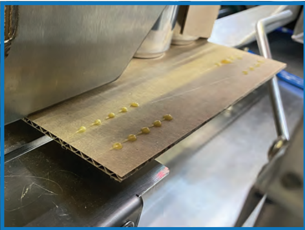
Electrical dot gap hot melt glue