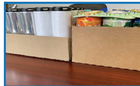
Low and high wall trays