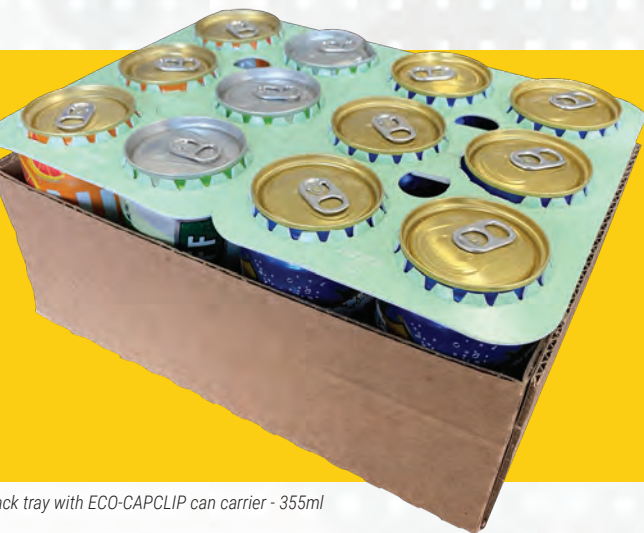
12 pack tray with ECO-CAPCLIP can carrier - 355ml