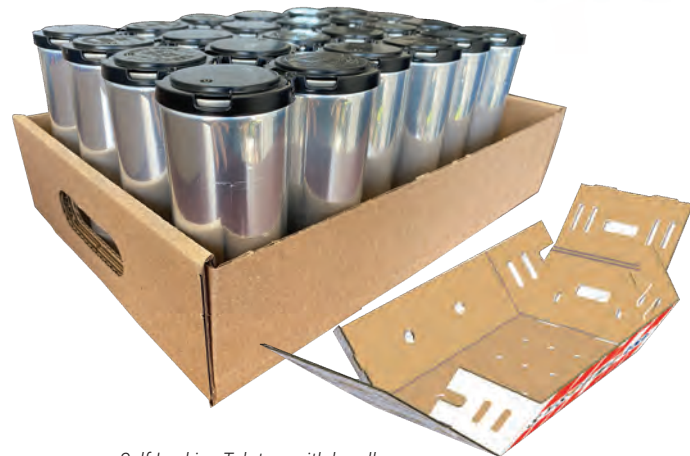
Self Locking Tab tray with handles