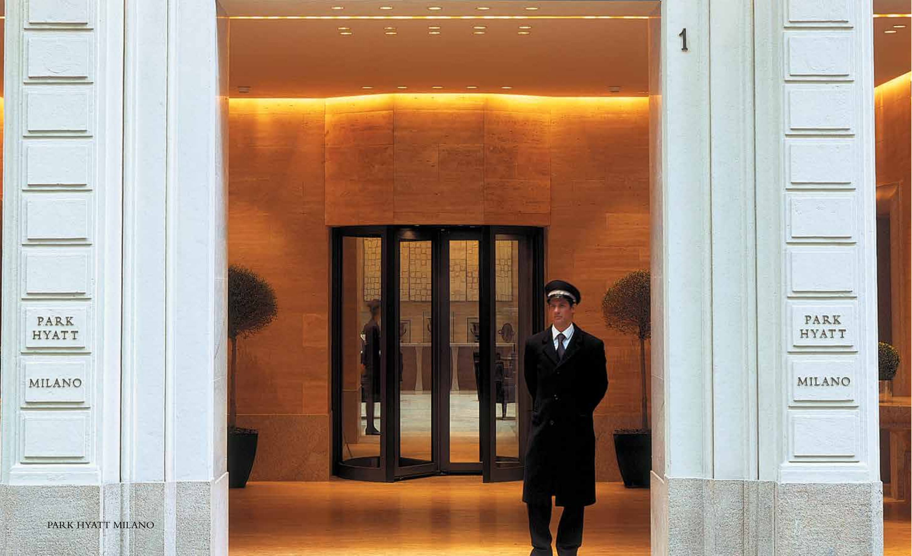
PARK HYATT MILANO