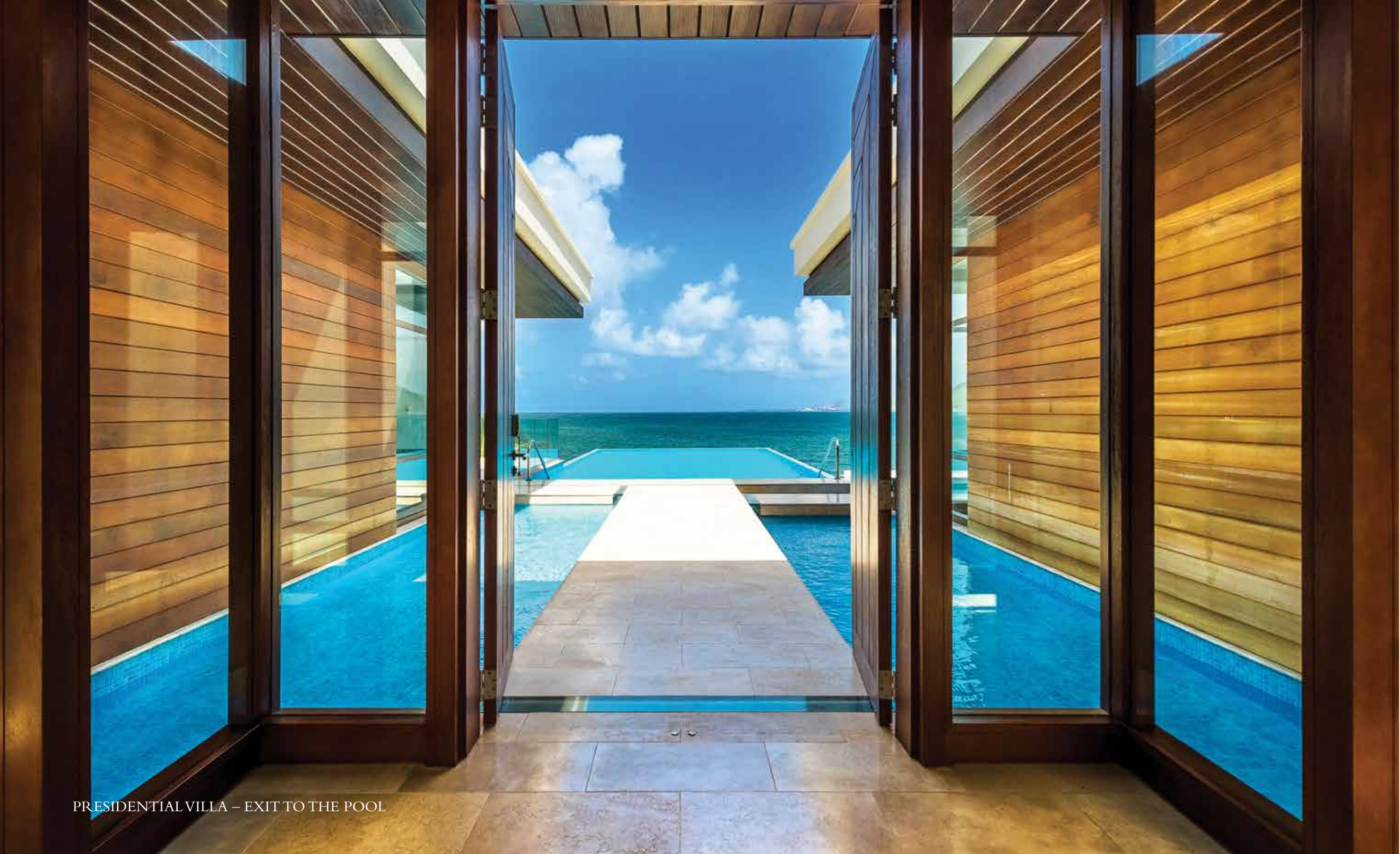
PRESIDENTIAL VILLA – EXIT TO THE POOL