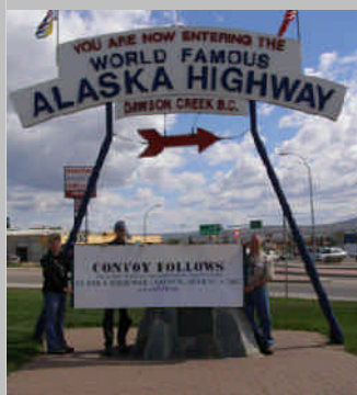
Recon Team Gathers Route Intelligence

We've got some cool t-shirts! This is the artwork on one of the shirts you'll see us wearing.