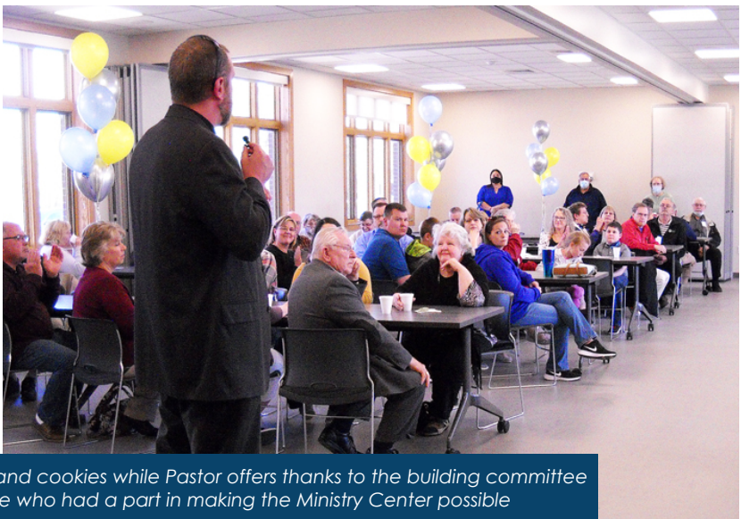
Enjoying cupcakes and cookies while Pastor offers thanks to the building committee and all those who had a part in making the Ministry Center possible