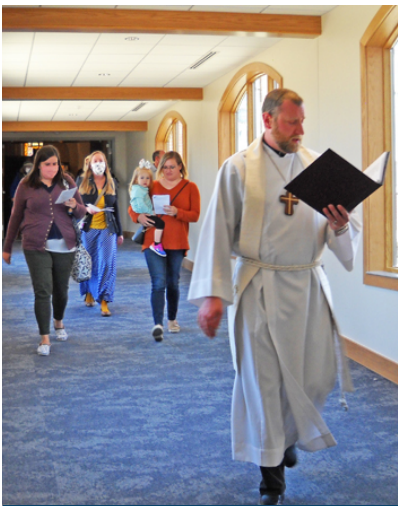
Pastor leading the congregation in song into the Ministry Center