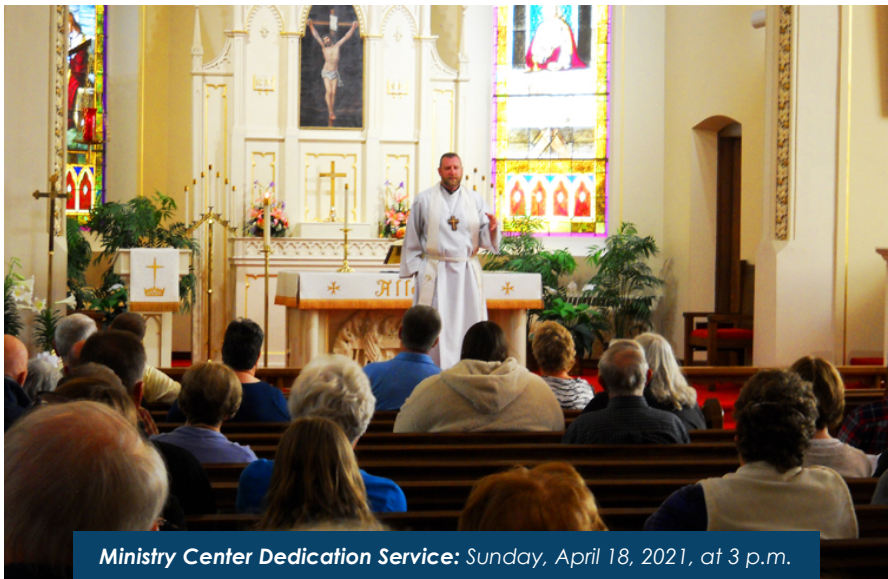
Ministry Center Dedication Service: Sunday, April 18, 2021, at 3 p.m.