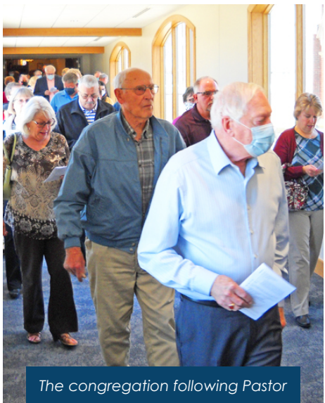
The congregation following Pastor