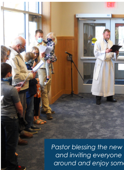
Pastor blessing the new building and inviting everyone to look around and enjoy some treats