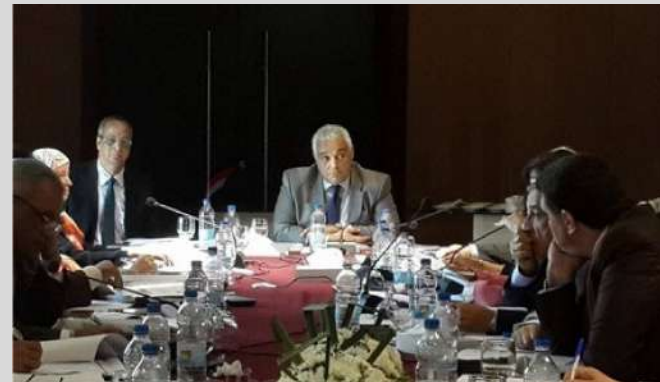
Annual General Meeting Chemical Industries Holding Company