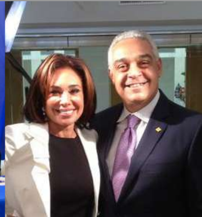
China - MENA event at The Middle East Institute