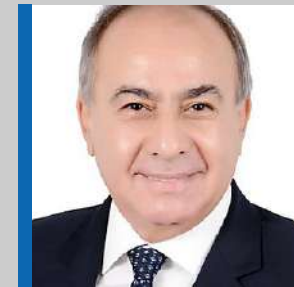
Alaa Fahmy Former Minister of Transportation