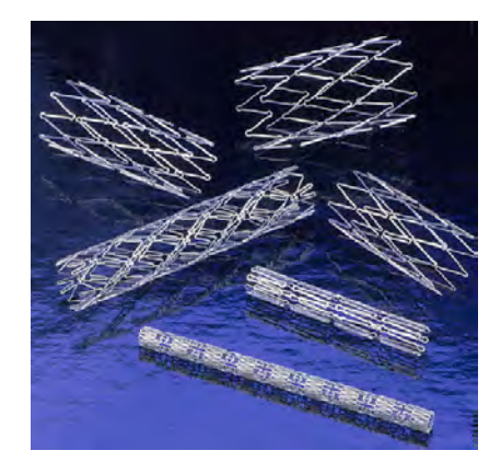
Figure 2: Examples of stents fabricated by laser cutting and electropolishing.

post cutting operations. The usual techniques for removing the recast materials and HAZ include electro-polishing, abrasive and vapor blast cleaning. Laser cutting is fast and very flexible, and cut geometry is readily changed through reprogramming of the CNC control. Figure 2 shows examples of finished stents fabricated by laser cutting and subsequent finishing.