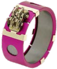
W900 Series Coupling