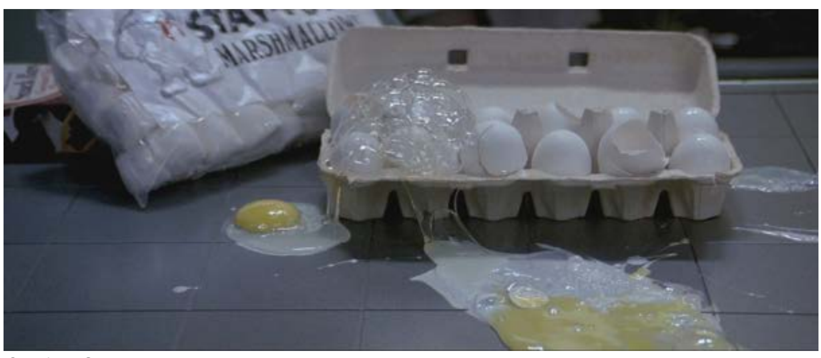
Shot from Ghostbusters

Notes: more ghostly activity, similar shot of eggs cooking on tv like in Ghostbusters, at Johny's house.