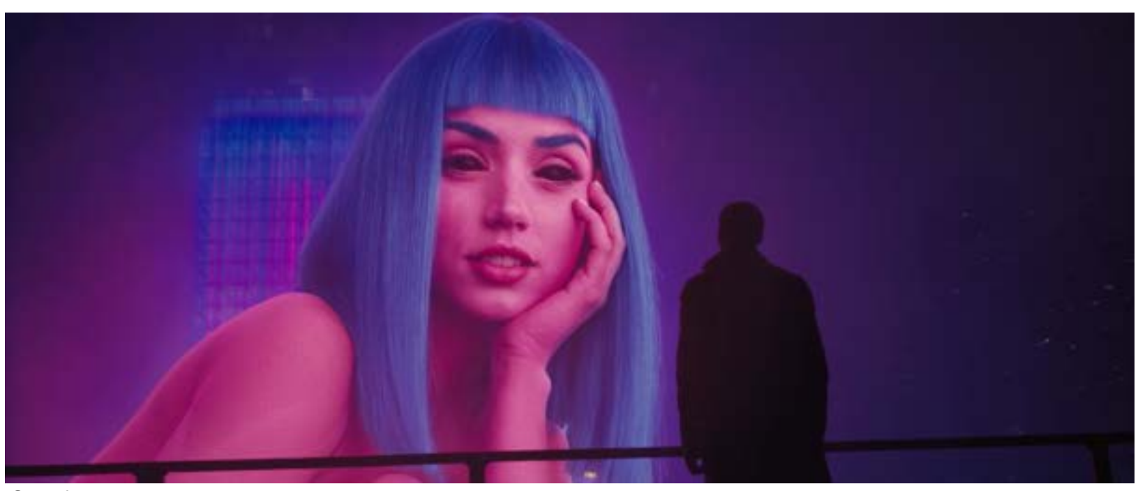
Shot from Blade Runner 2049

Notes: Jennifer the prostitute Johny and Shawn meet could look similar to her with dark blue hair.