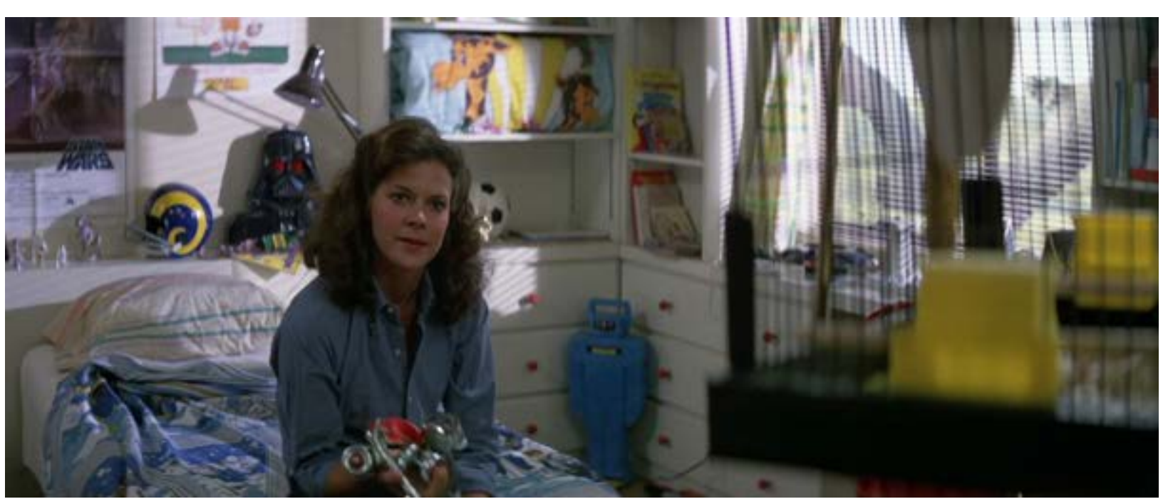
Shot from Poltergeist