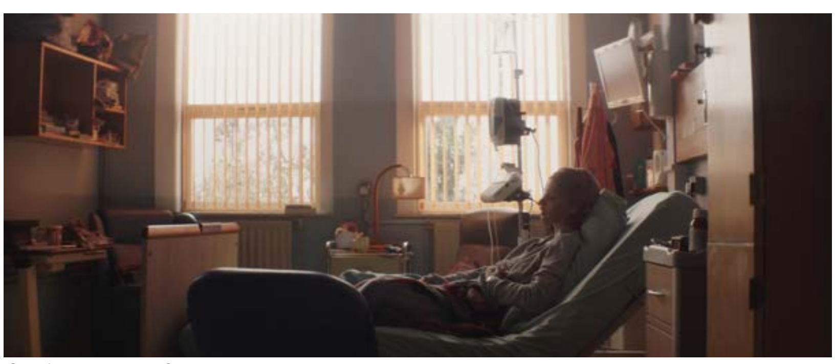
Shot from A Monster Calls