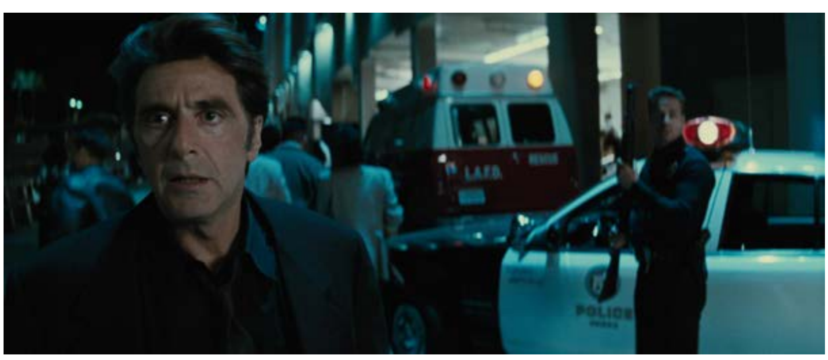
Shot from Heat