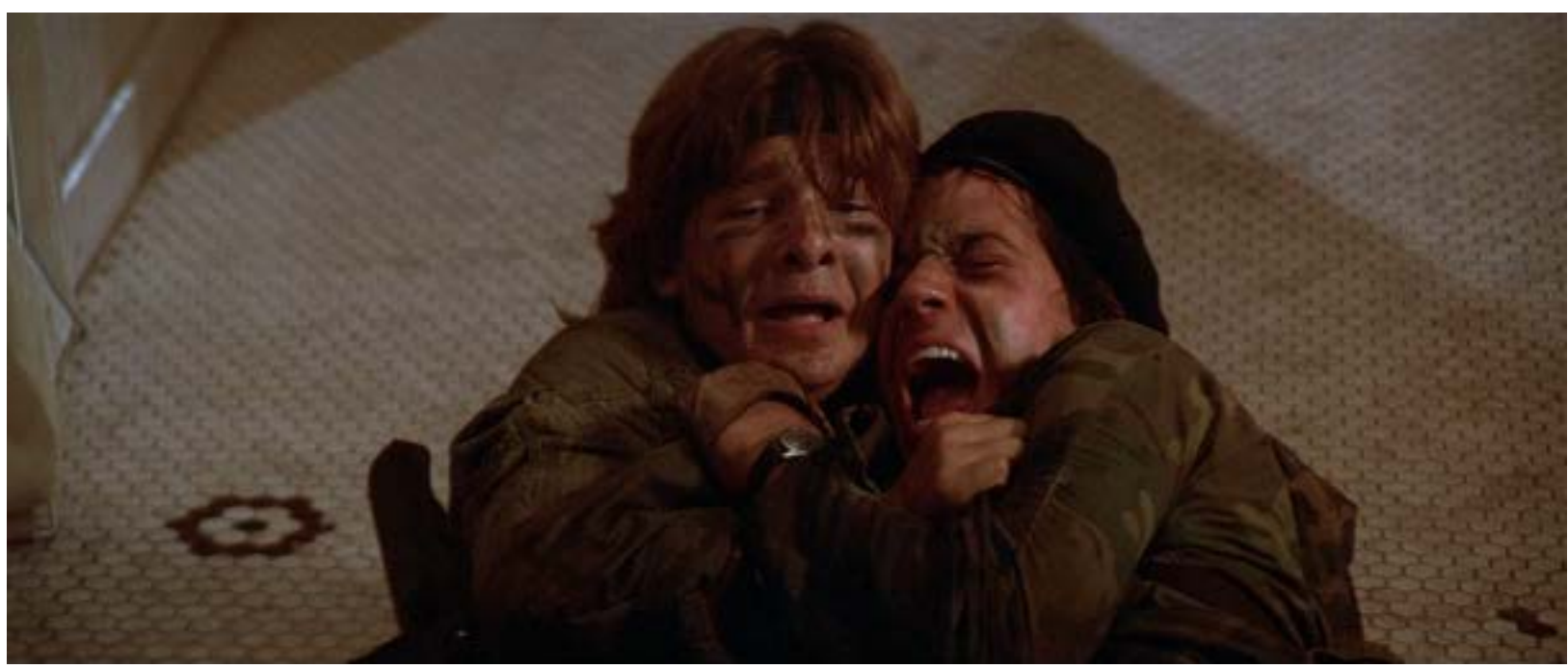
Shot from The Lost Boys