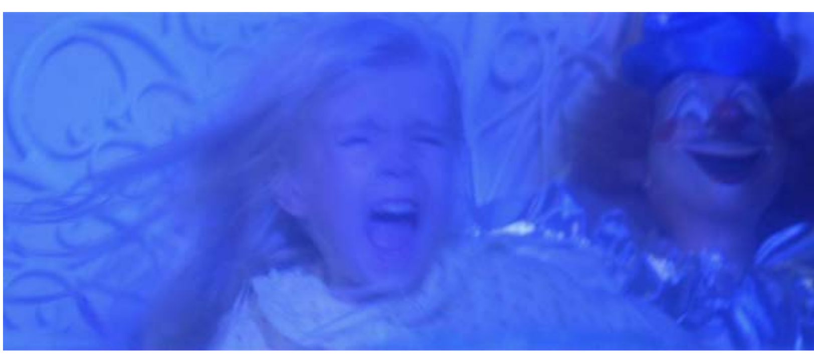
Shot from Poltergeist

Notes: Gina's daughter Ashley experiencing ghostly activity in her room, similarly lit and same composition for a shot. Try to find same clown doll or very similar one.