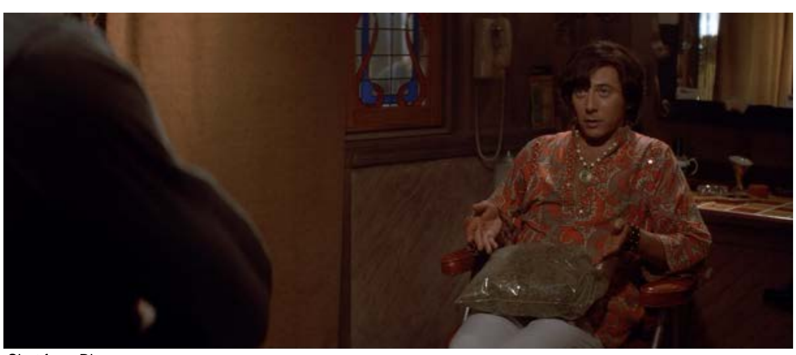
Shot from Blow

Notes: Bonnie asks Johny to go outside the hospital to smoke a joint with her.