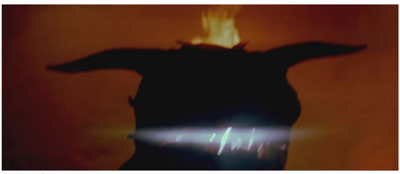
Shot from Ghostbusters