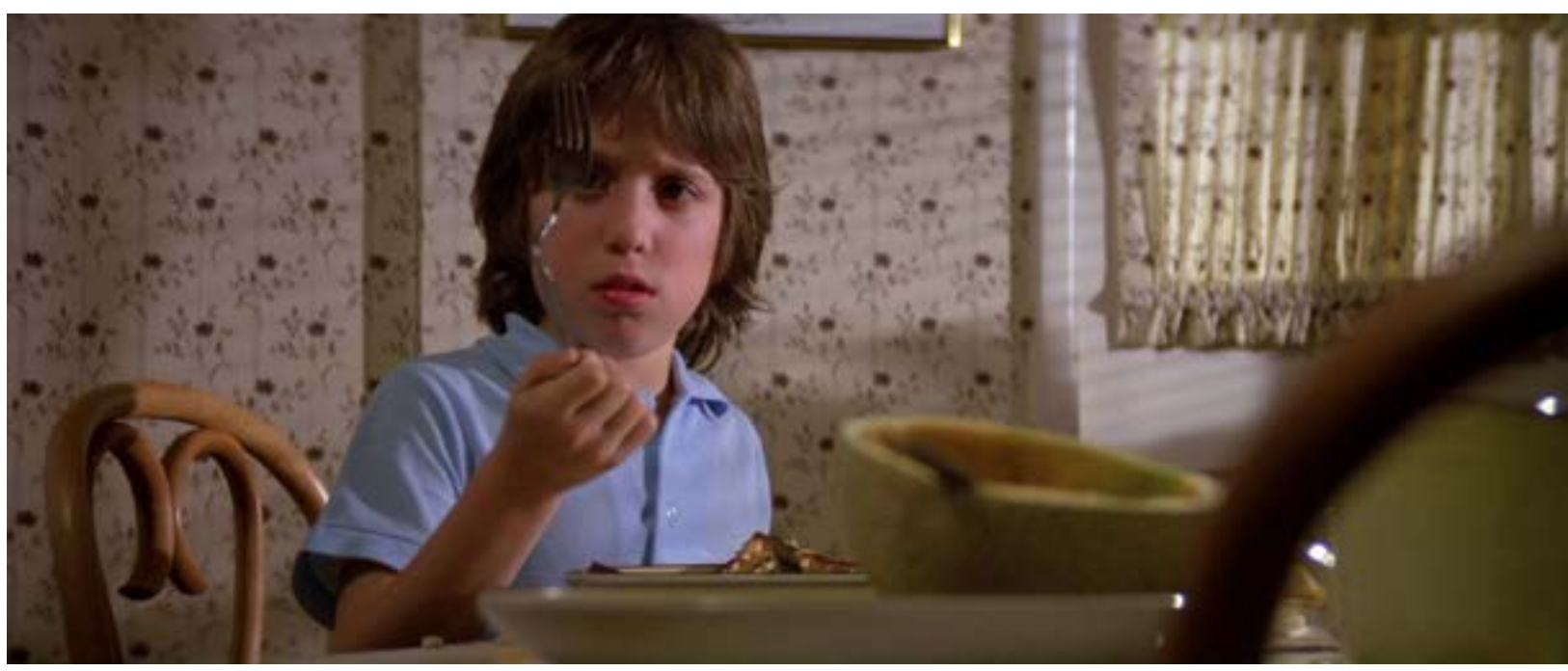
Shot from Poltergeist