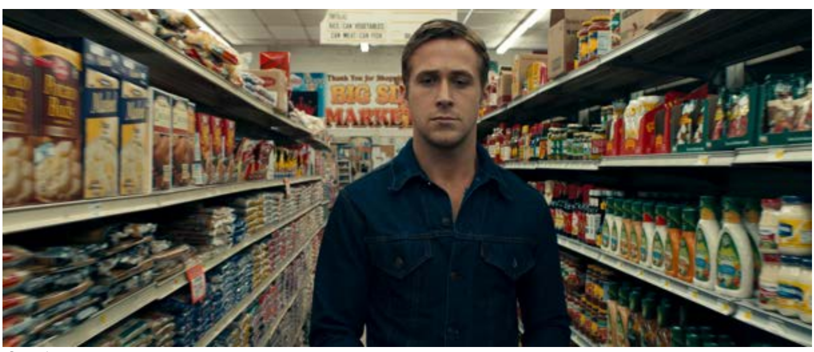
Shot from Drive