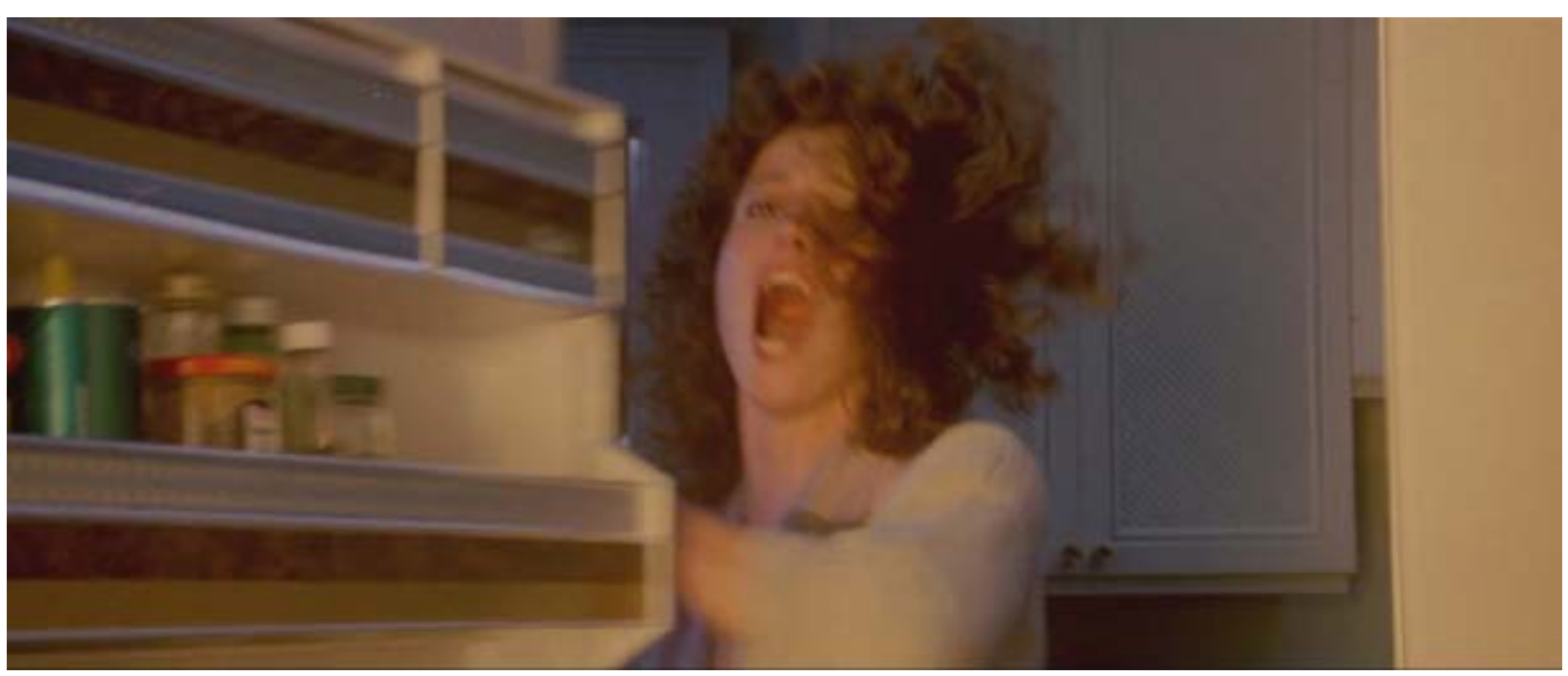
Shot from Ghostbusters

Notes: Same shot as in Ghostbusters, from inside fridge.