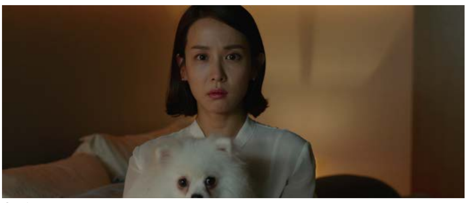
Shot from Parasite