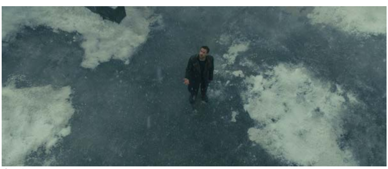
Shot from Blade Runner 2049