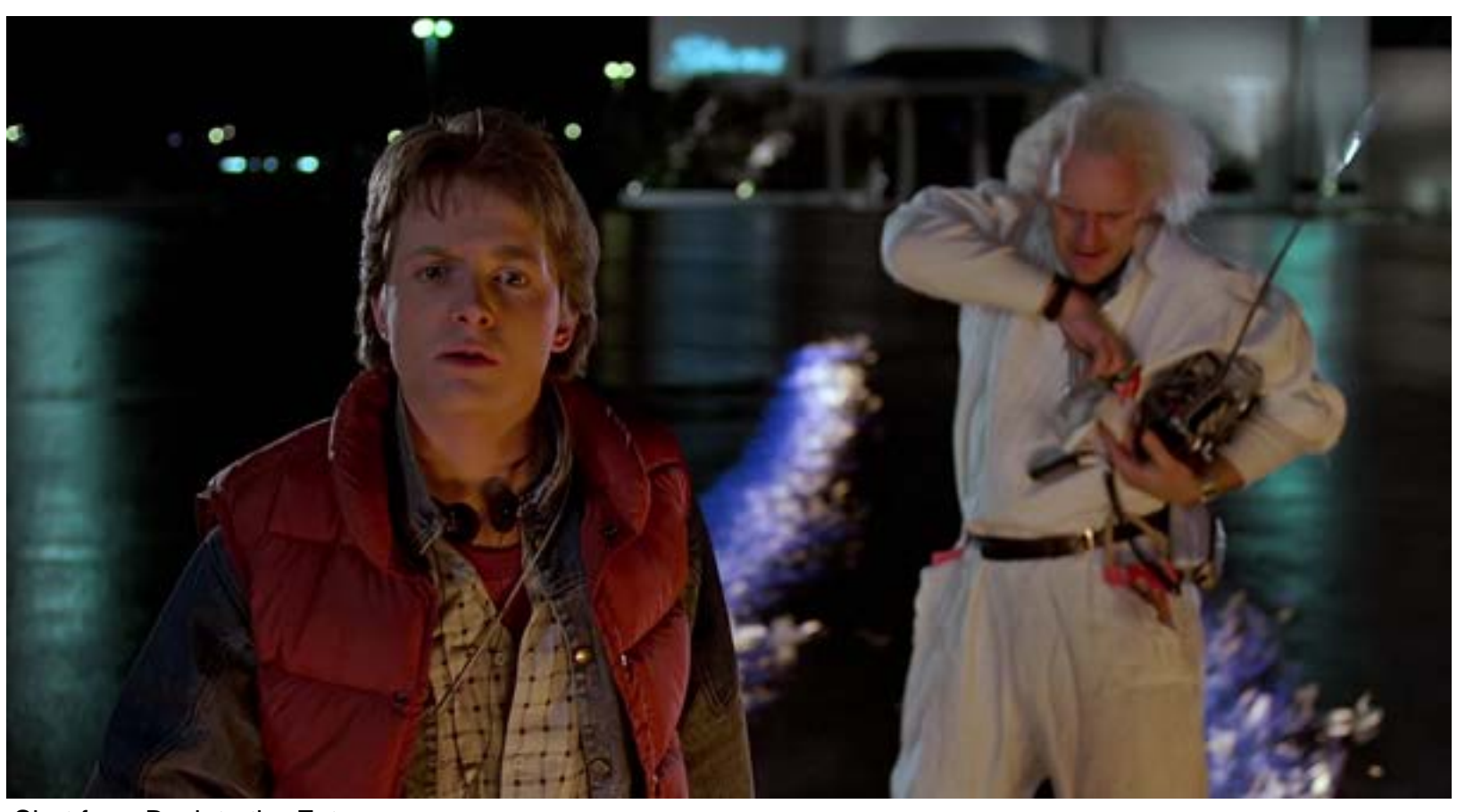
Shot from Back to the Future