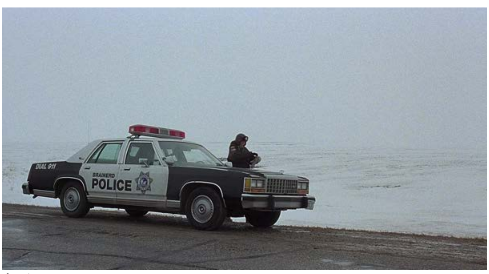
Shot from Fargo