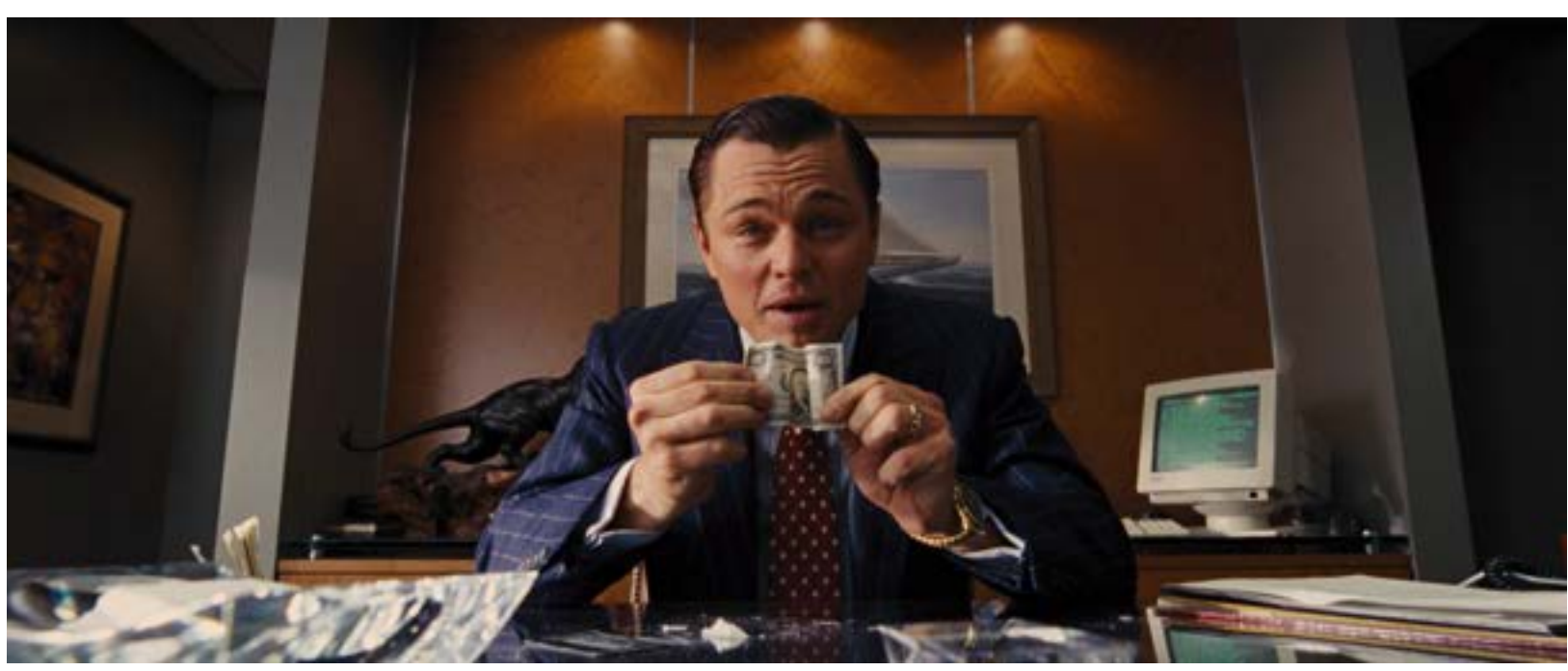
Shot from The Wolf of Wall Street