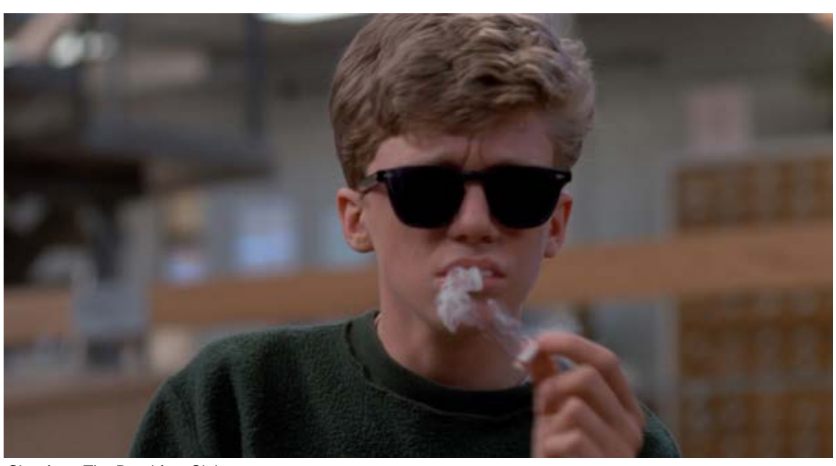
Shot from The Breakfast Club

Notes: Reenact same smoking weed shot as this scene in The Breakfast Club.