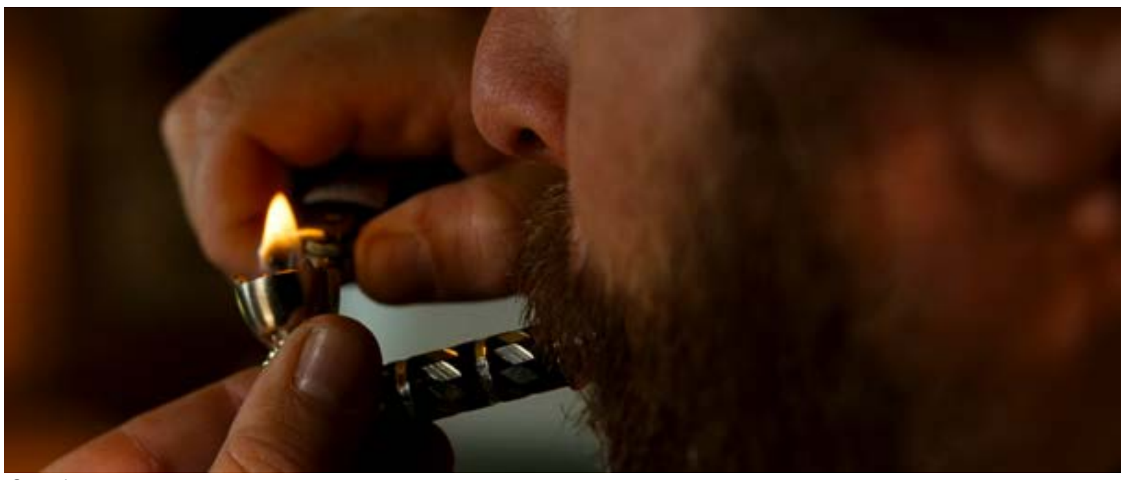
Shot from Due Date