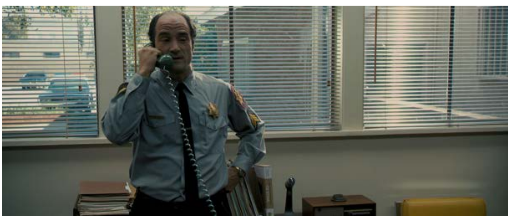
Shot from Zodiac