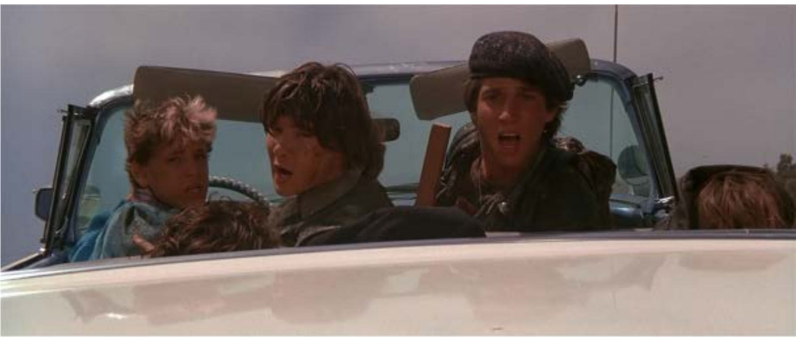
Shot from The Lost Boys