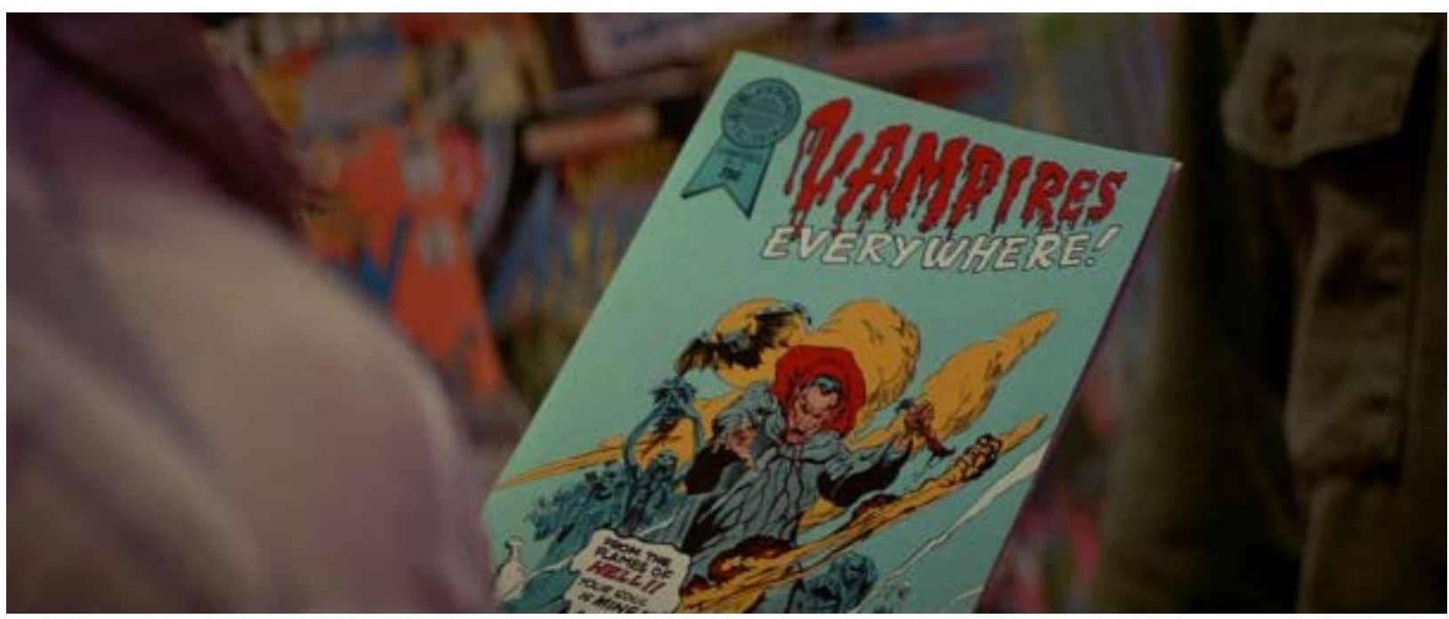
Shot from The Lost Boys