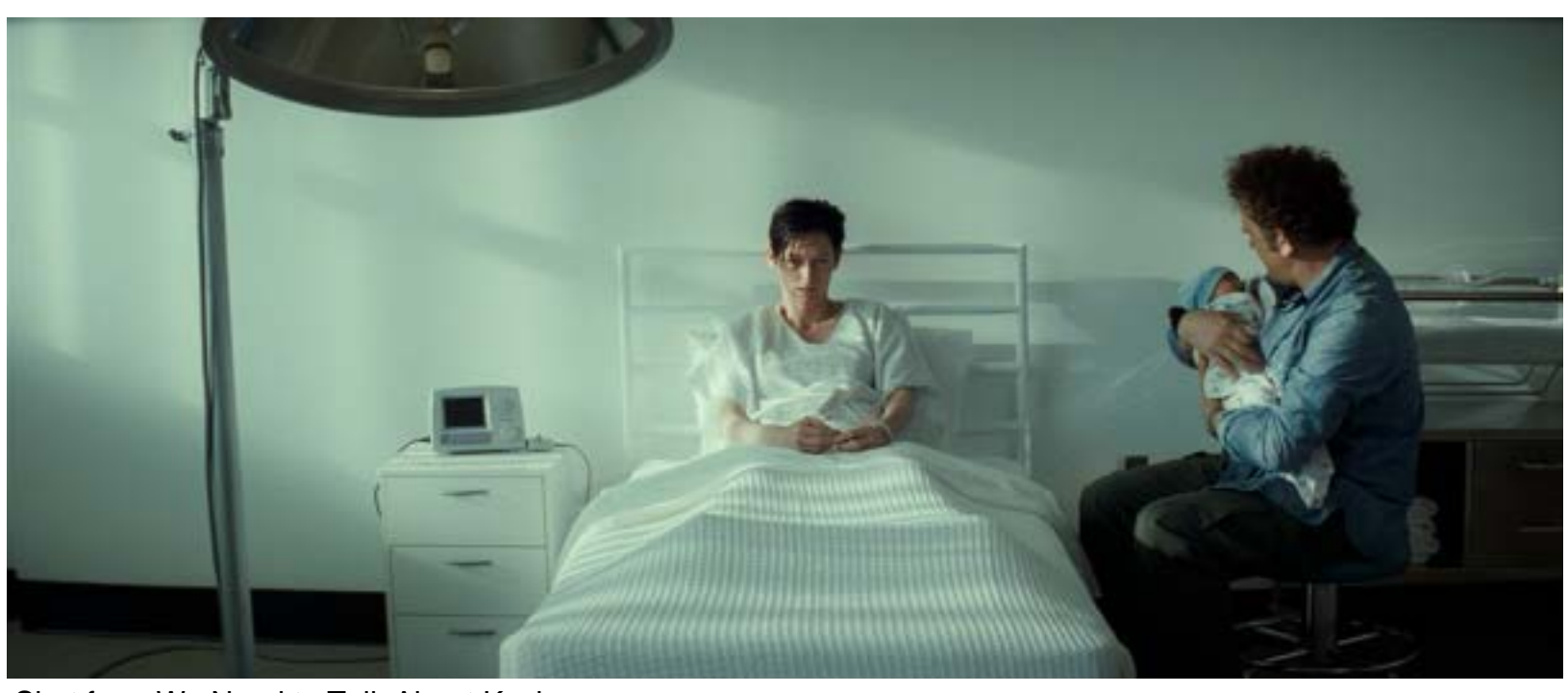
Shot from We Need to Talk About Kevin