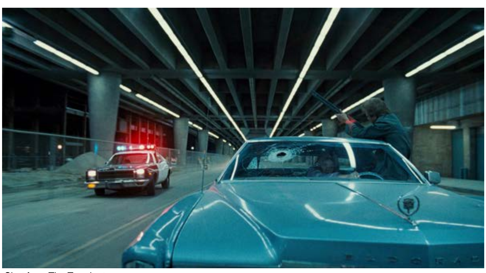
Shot from The Terminator

Notes: Similar police chase scene as The Terminator.