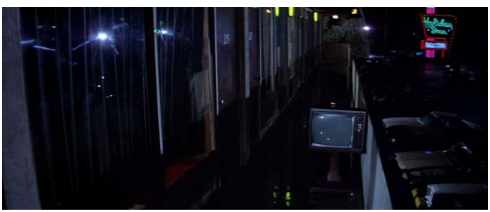
Shot from Poltergeist

Notes: Ashley earlier on could be in front of tv with static like the little girl in Poltergeist... we could have a shot of their tv outside thei house.