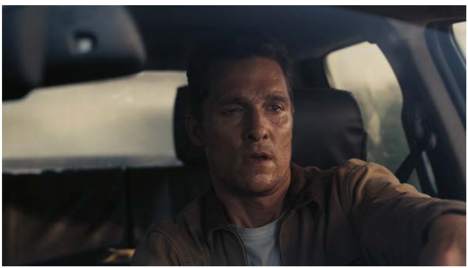
Shot from Interstellar

Notes: lighting and camera of Interstellar.