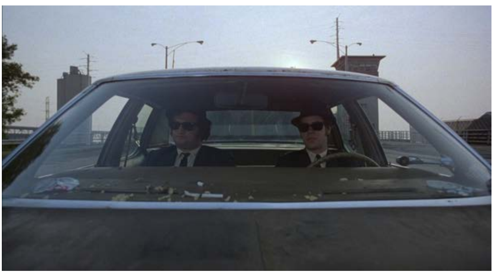
Shot from The Blues Brothers

Notes: When Gina, Captain and Johny try to get the weed back from Hollywood's, they are on a Mission from God, similar shot to The Blues Brothers.