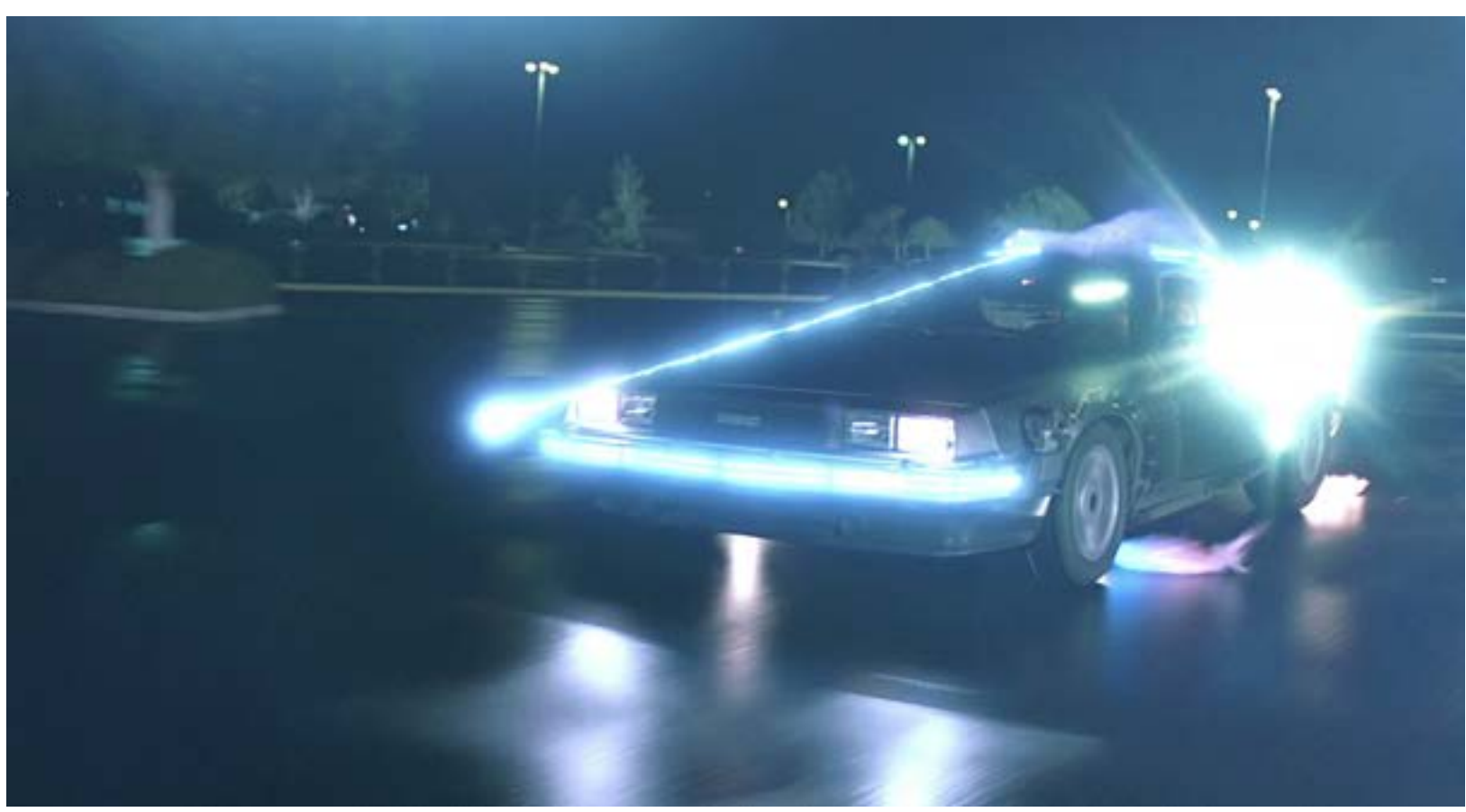
Shot from Back to the Future

Notes: Captain owns a Delorian and similar shot as this in Back to the future, with similar VFX.