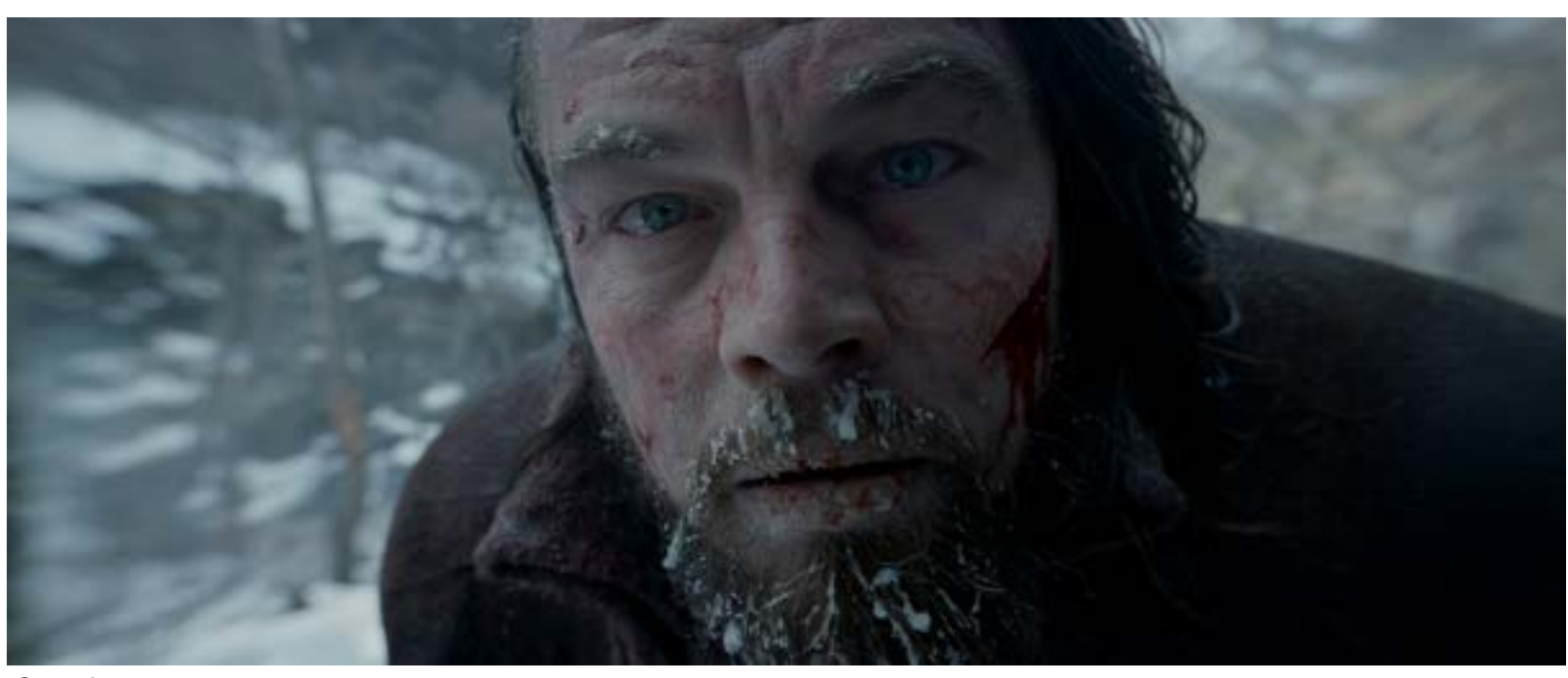
Shot from The Revenant