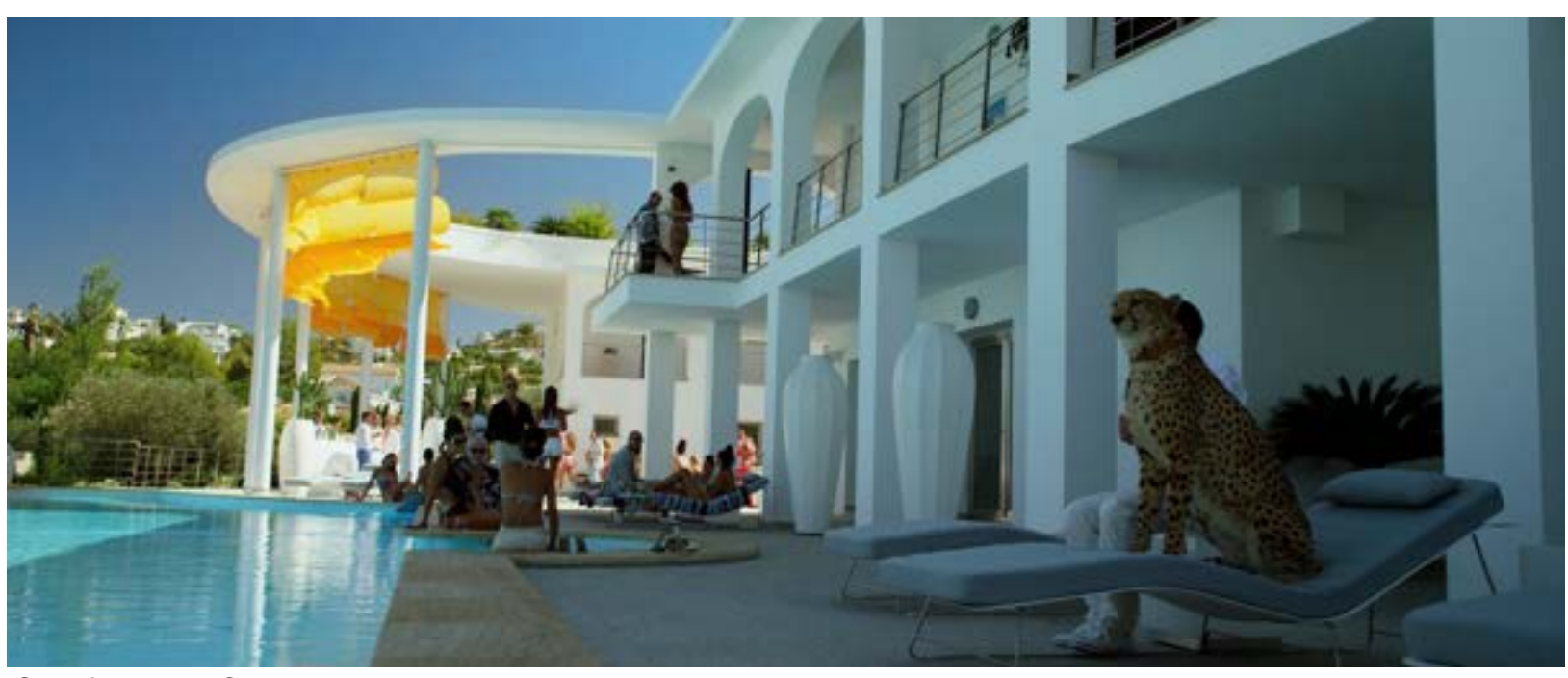
Shot from The Counselor