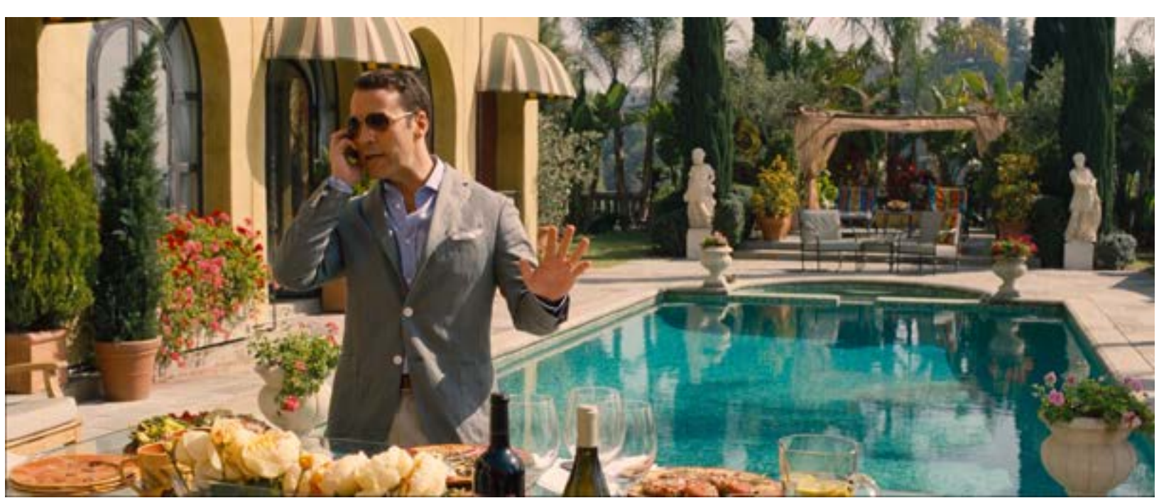
Shot from Entourage