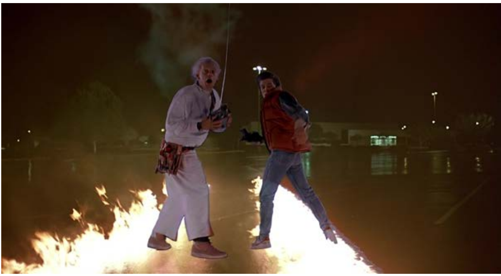
Shot from Back to the Future