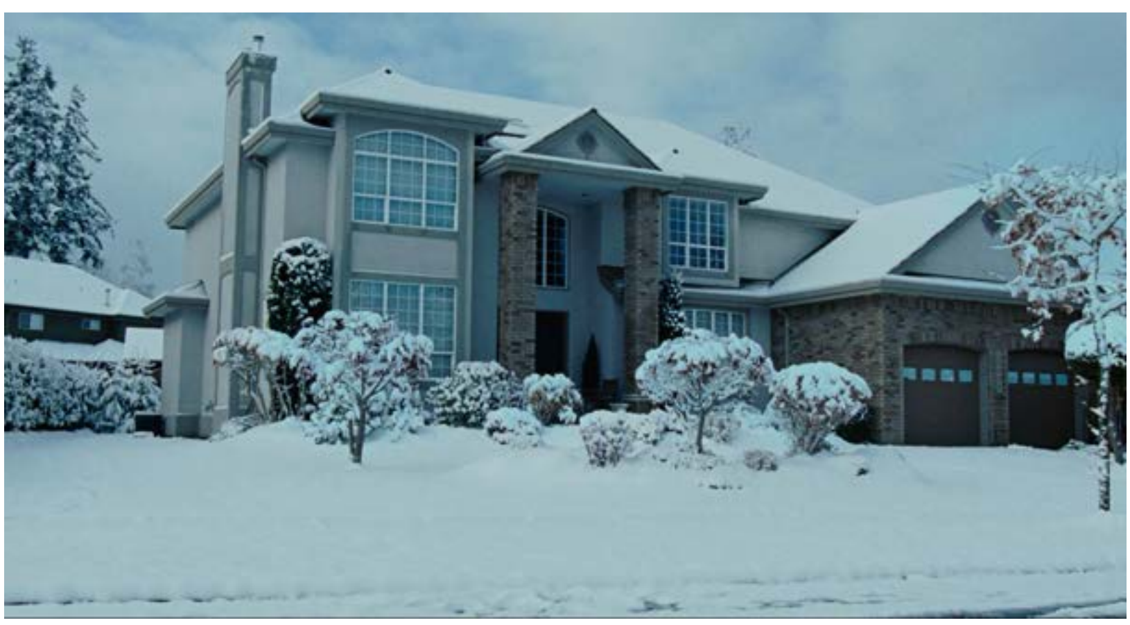
Shot from Juno