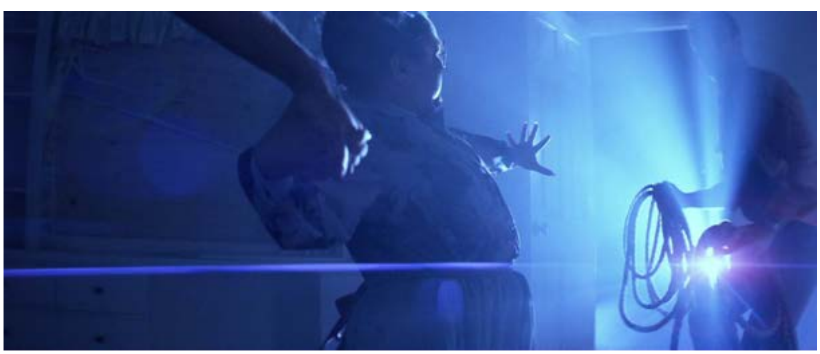
Shot from Poltergeist

Notes: similar shot and lighting as Poltergeist.