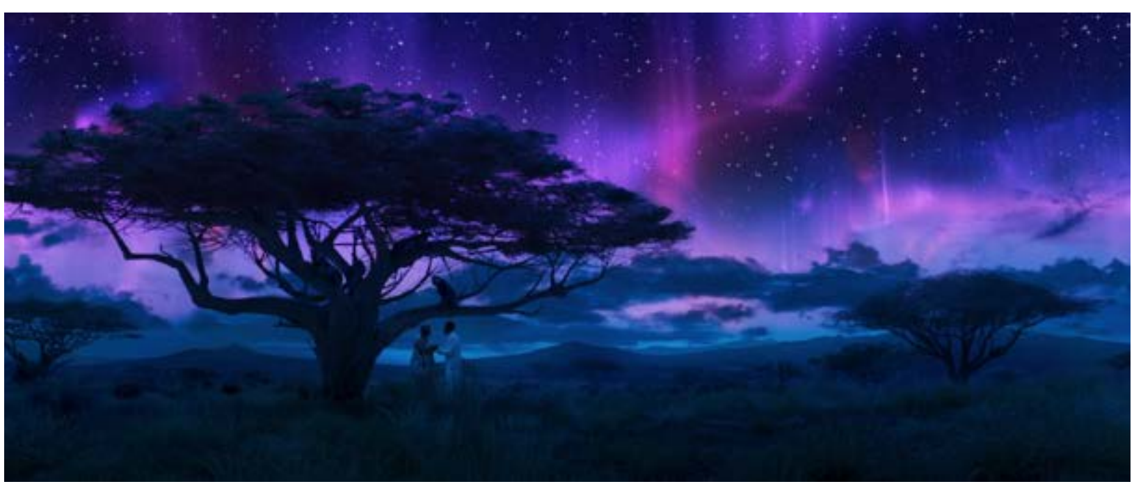
Shot from Black Panther

Notes: Beautiful Northen lights showing the release of Gina's spirit as charged particles into the heavens.