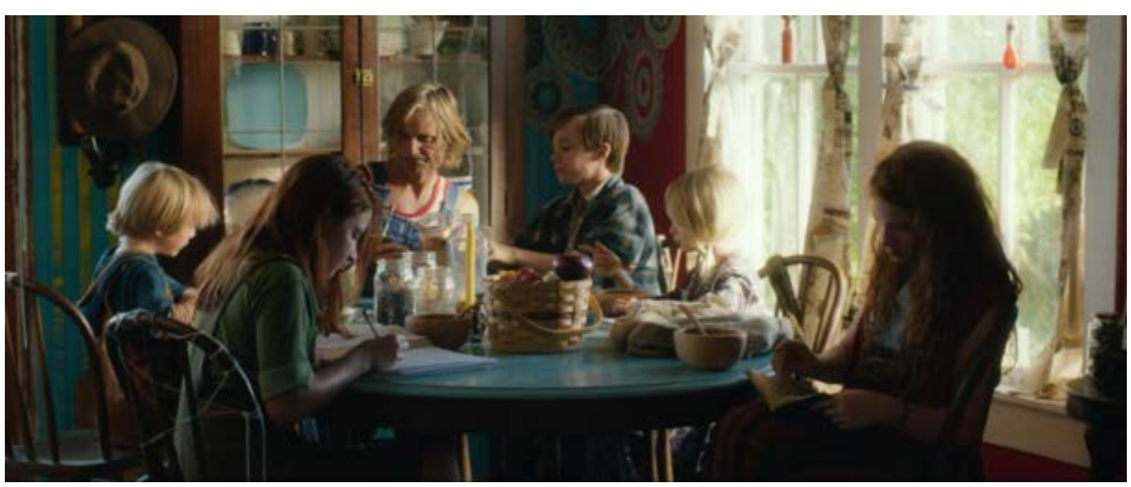
Shot from Captain Fantastic