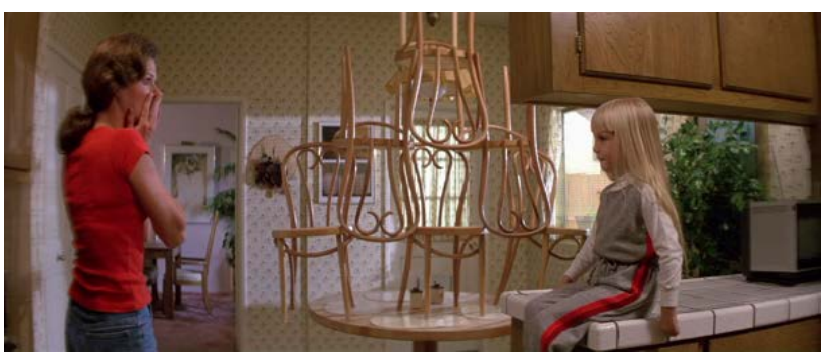
Shot from Poltergeist

Notes: Because Captain's magical 80s space weed makes 80s pop culture happen... we see wood chairs at Gina's stacked like this in Poltergeist as an omage and a hint that POTHOLES is psycho-spiritual.