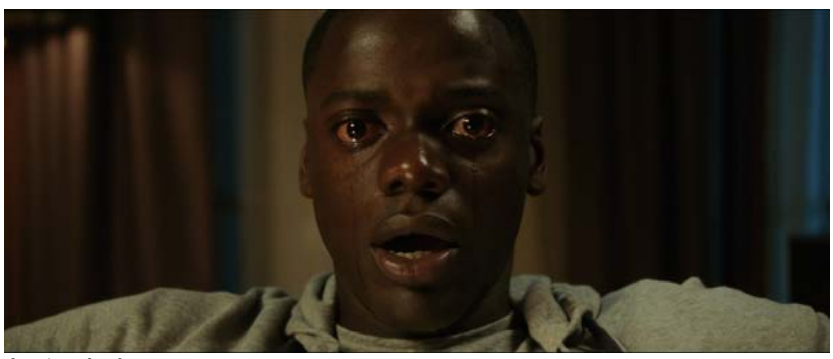
Shot from Get Out