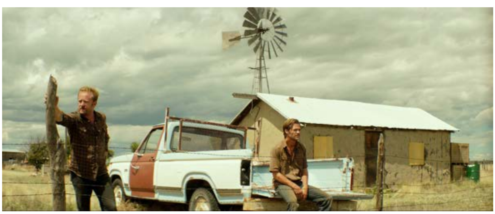
Shot from Hell or High Water