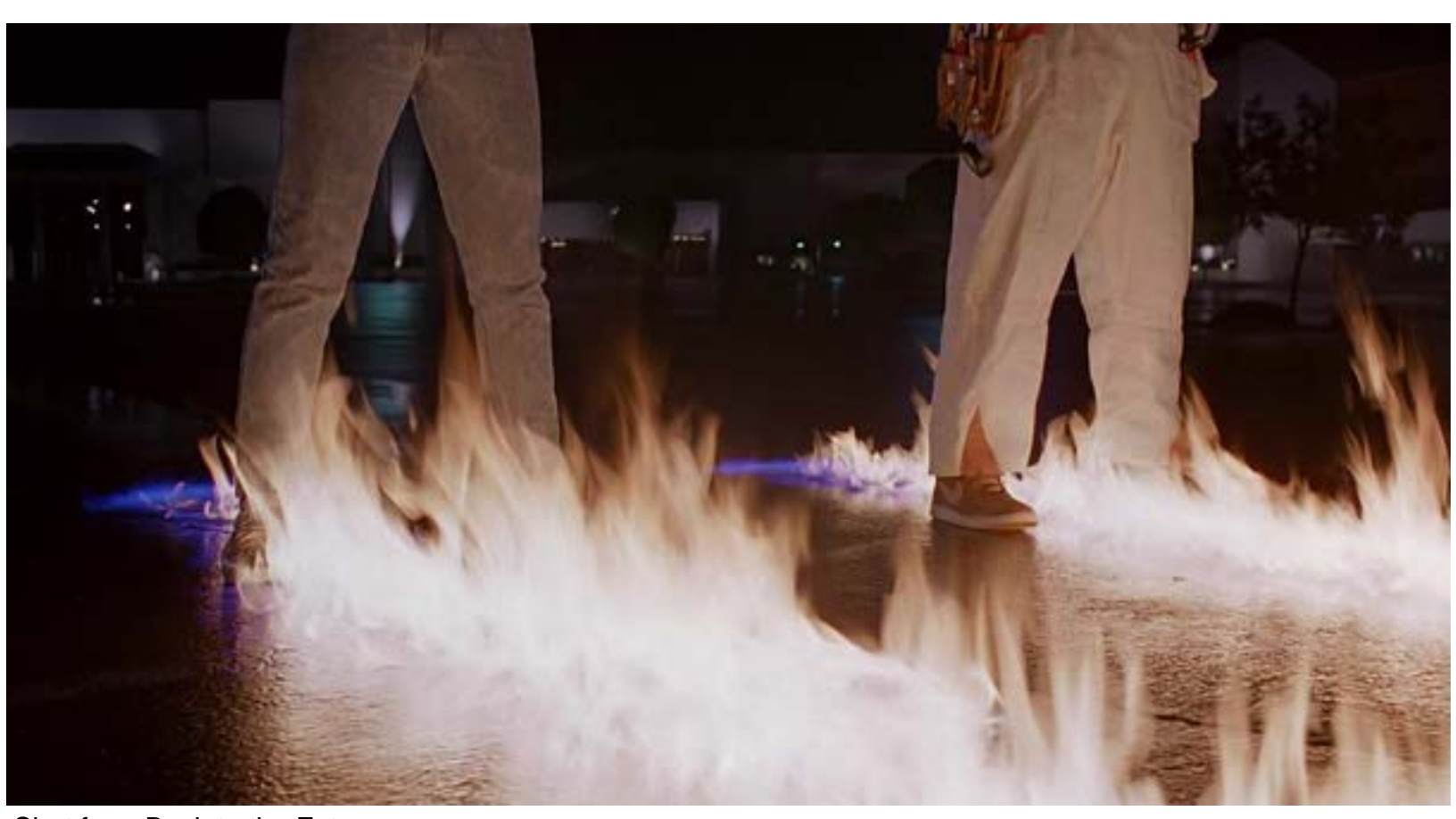
Shot from Back to the Future