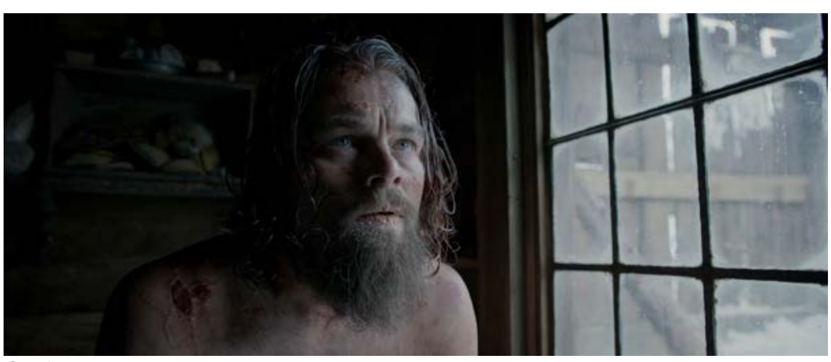
Shot from The Revenant