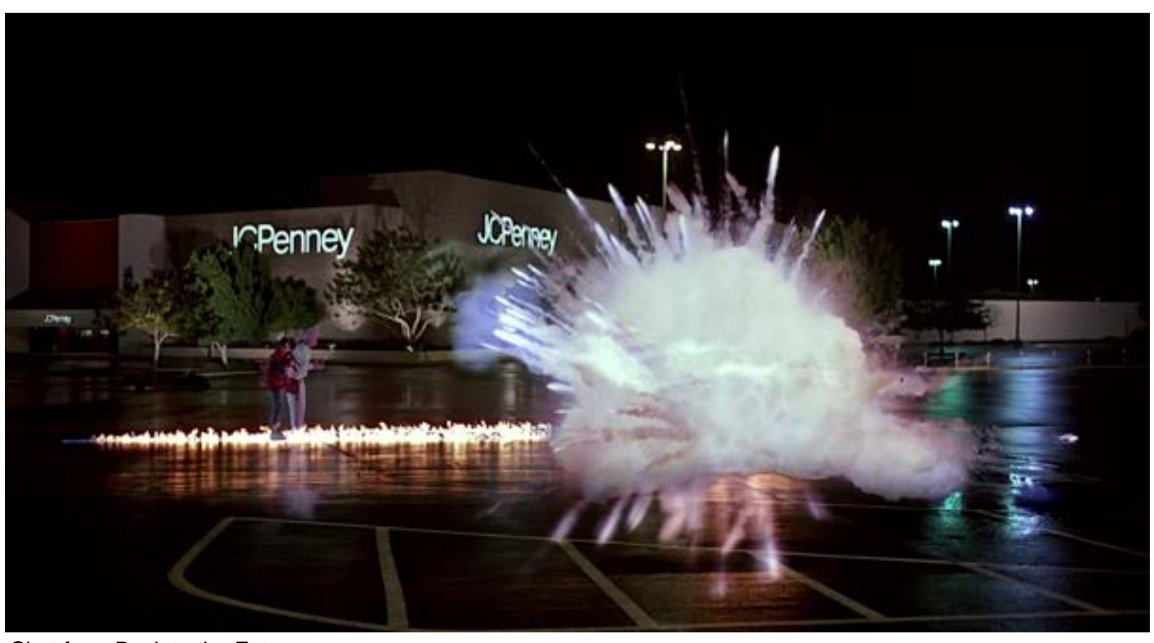
Shot from Back to the Future

Notes: similar shot of Captain's car with flames.