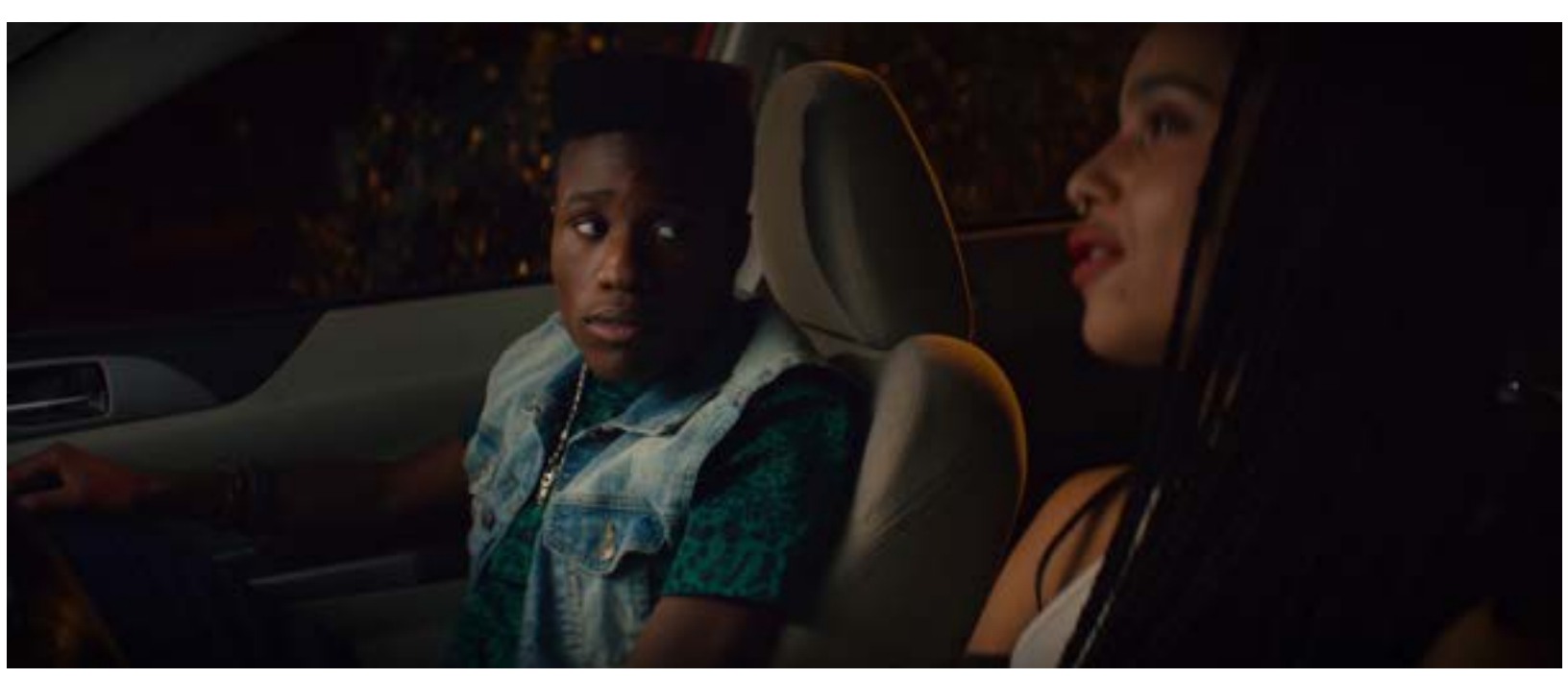
Shot from Dope

Notes: Johny with prostitute Jennifer driving real fast.