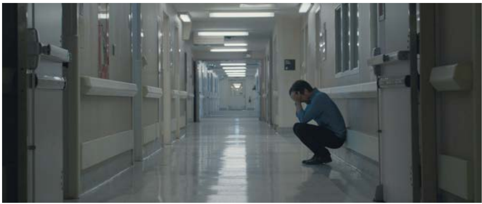
Shot from The Gift

Notes: Johny ends up in the UofA Psych Hospital