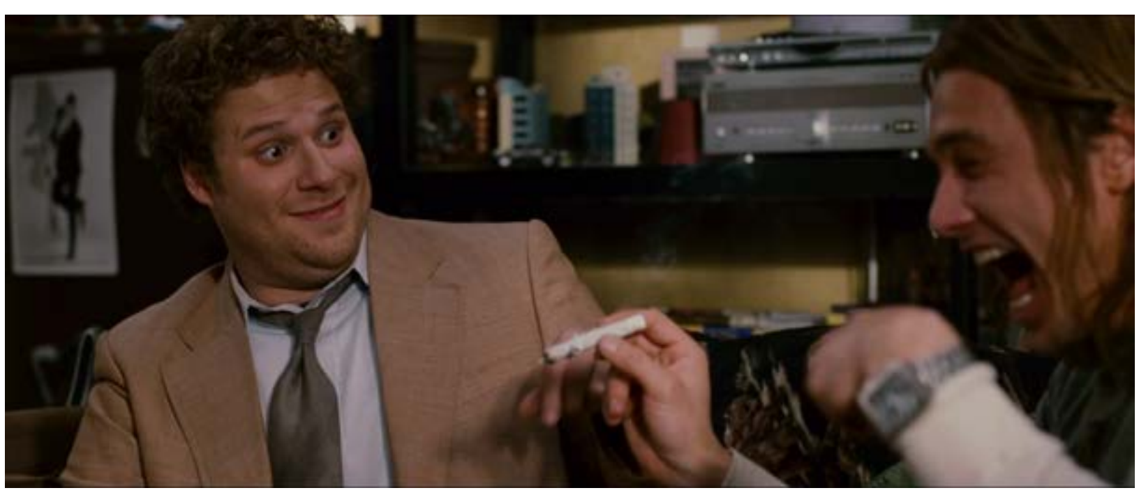
Shot from Pineapple Express