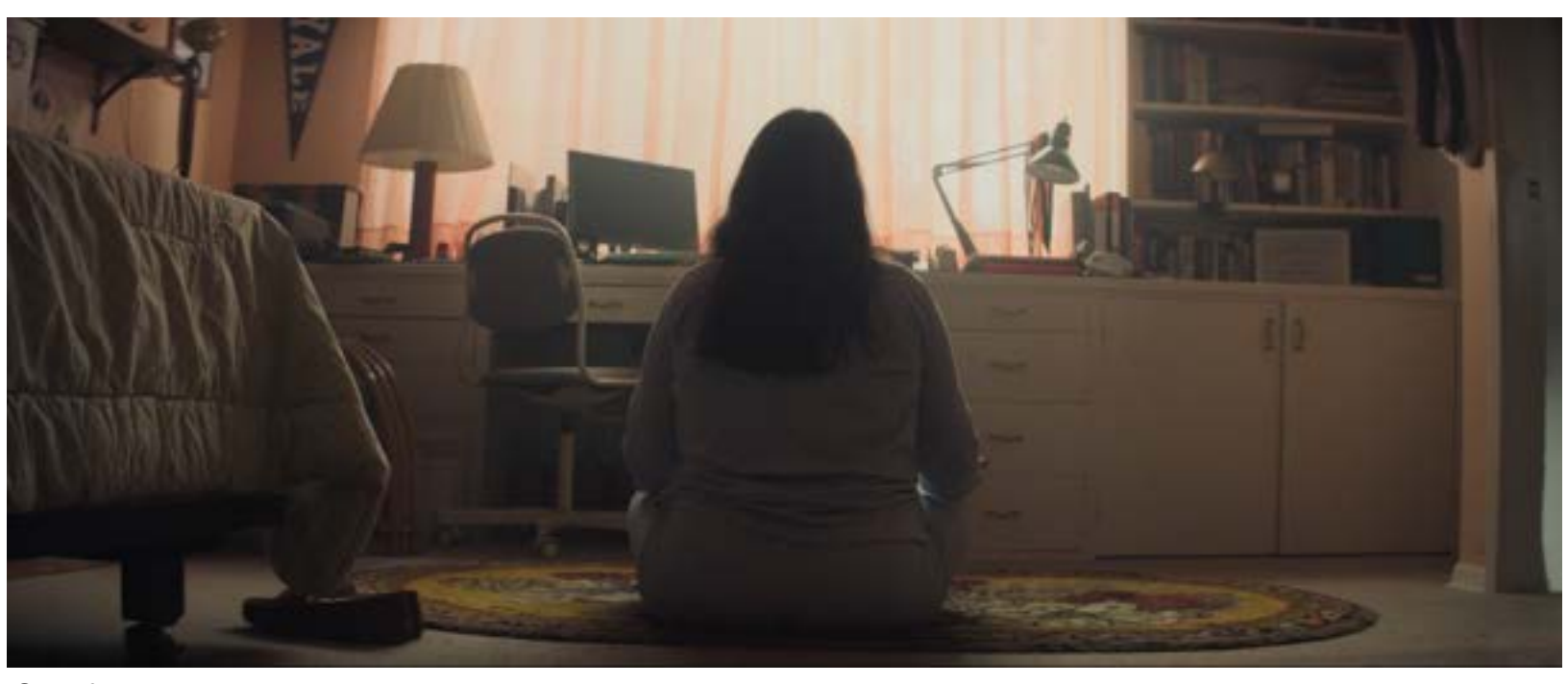
Shot from Booksmart