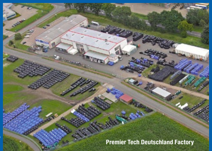
Premier Tech Deutschland Factory