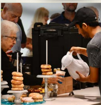
Coffee + Donuts