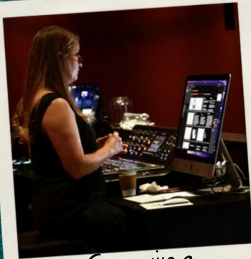
Growing AVL Team