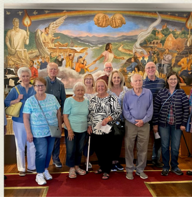
Supporting Haywood Street