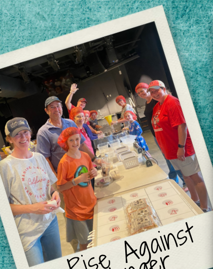
Rise Against Hunger