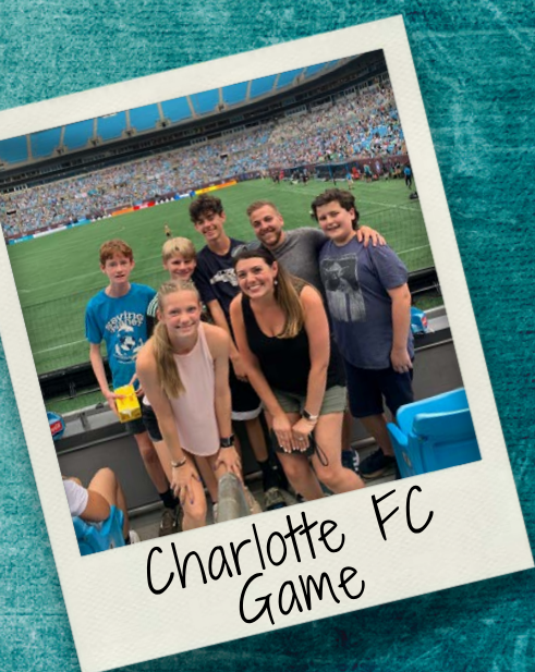
Charlotte FC Game

Our Student Ministry led 165 participants at 10 events, with 7 students attending summer camp at Ridgecrest.