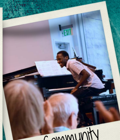
Community Talent Show