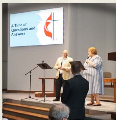
Future of the UMC