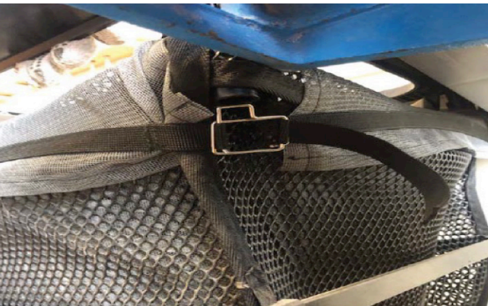
Image of correct liner installation, with fastener attached to the appropriate buckle with no obstruction of LittaTrap™ bypass