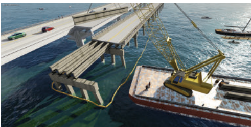
Photo-realistic environments of your multi-phase ideas. MOT renderings are critical for every design-build project.